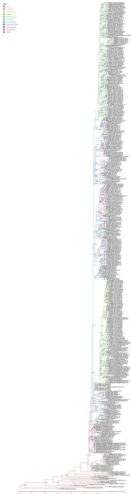
Appendix Figure 1. Maximum clade credibility phylogeny. The tips of the tree are colored according to their sampling location, and branches are colored according to their most probable geographic location: Asia (red); Cabo Verde (orange); North America (yellow); Caribbean (olive green); Central America (green); North Brazil (sea green); Northeast Brazil (light blue); Centre West Brazil (blue); Southeast Brazil (purple); South America (pink); Pacific (magenta). Posterior probabilities are shown at each node on the tree. Note that sequences from the 2016 Angola outbreak (1) were published during the later stages of this manuscript preparation and were therefore not included in the Bayesian analysis.