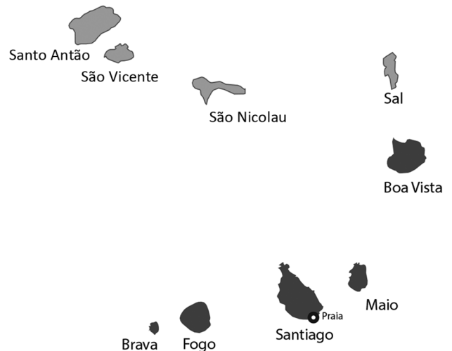
Figure 1. Locations of suspected Zika cases (dark gray shading), Cape Verde, 2015–2016. Only 2 cases on Boa Vista were confirmed, and those might have been imported.

We tested acute serum samples (obtained < 5 days after symptom onset; n = 387 ) and, when available, matched urine samples ( n = 82 ) by quantitative reverse transcription PCR (qRT-PCR). We extracted RNA from serum or urine samples using the QIAamp Viral RNA Mini Kit (QIAGEN, https://www.qiagen.com ) according to the manufacturer's recommendations and performed a 1-step real-time PCR assay (10) on an ABI7500 instrument (Applied Biosystems, https://www.thermofisher.com ) using the QuantiTect Probe RT-PCR Kit (QIAGEN).