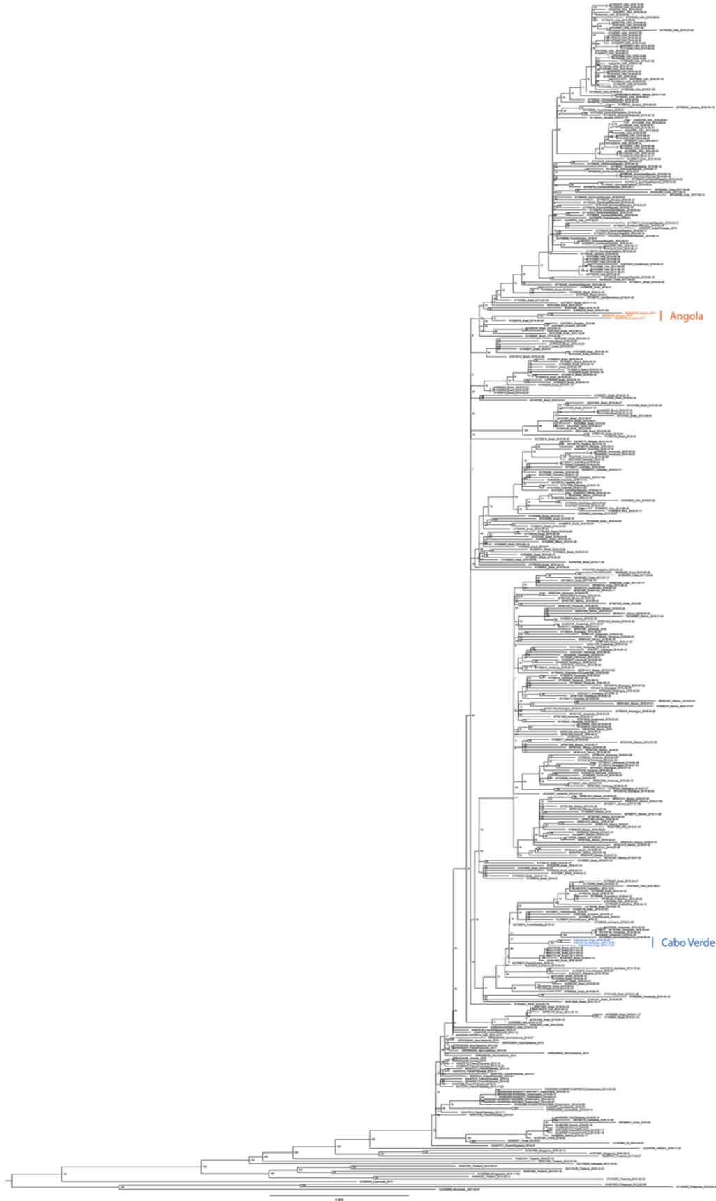
Appendix Figure 2. Maximum likelihood phylogeny of the Zika virus. The tree was estimated with IQ-Tree 1.6.7.2 using 459 complete and partial genomes (including three genomes from Angola). The Angola and Cabo Verdean clusters are colored in orange and blue, respectively. Bootstrap supports (ultrafast bootstrap approximation) are shown at each node on the tree.