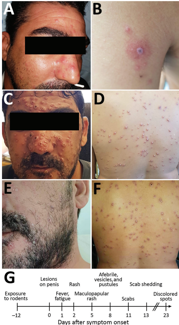
Figure 1. Dermal manifestations of monkeypox on patient in Israel, 2018. Maculopapular rash was apparent on the face (A) and body on the day of hospital admission. A lesion on the left proximal extremity (B) was suspected to be a rickettsial eschar. After 3 days, the rash changed into vesicles and pustules on the face (C) and body (D). Skin resolution was apparent 13 days after admission; pustules and vesicles crusted and were shed (E, F). Timeline of disease progression.

Thus far, all imported cases of monkeypox in humans (United States in 2003, United Kingdom and Israel in 2018) have involved the West African clade of the virus (3,6). After a similar incubation period (12 days), all patients had fever and chills, lymphadenopathy, and skin lesions (5,6). Although the patient in Israel had numerous vesiculopustules on his face and body, the patients involved in the US outbreak had substantially fewer (1–50) and reported a