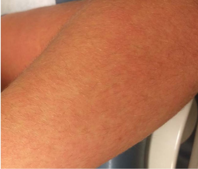
Technical Appendix Figure 1. Scarlitiform rash in a patient with urine positive for Zika virus on reverse transcription PCR. Picture taken 4 days after the onset of symptoms.