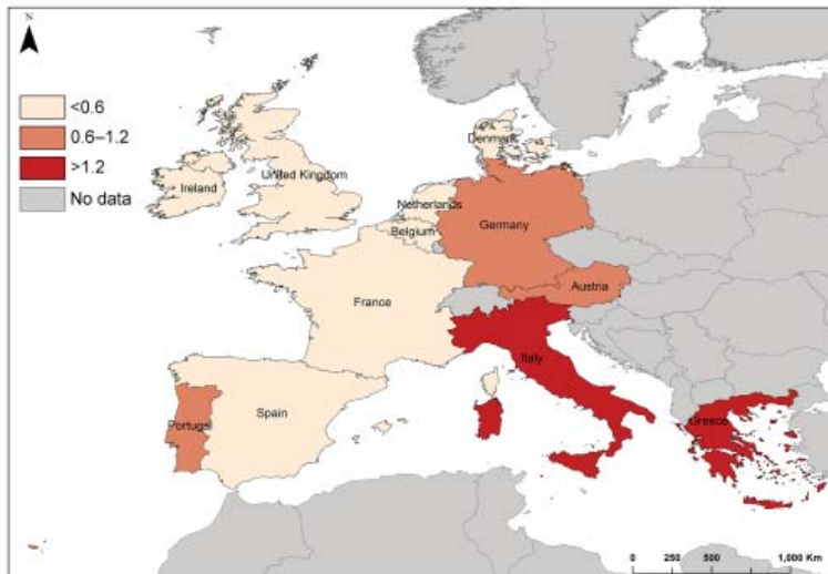
Figure 2. Risk for travel-associated Legionnaires' disease in residents of Denmark, France, the Netherlands, and the United Kingdom who traveled to countries in Europe. Risk is displayed in countries where travelers spent at least 5 million nights in commercial accommodations during 2009, European Union/European Economic Area (in cases per million nights).

counted for nearly one third of all nights spent by nondomestic travelers in Spain; because Germany did not participate in the European TALD surveillance, any cases that may have occurred in German travelers were not reported.