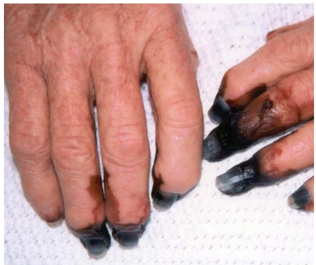
Figure 1. Digital gangrene in a patient (case 2) with Rickettsia australis infection.

The second patient had a clinical picture usually associated with overwhelming bacterial infection. N. meningitidis was considered a possible cause of her illness. However, her 2-week illness before deterioration was not typical.