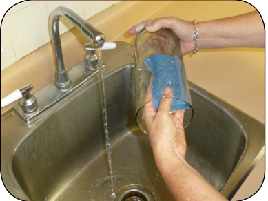
Weekly, scrub vases & containers to remove mosquito eggs.