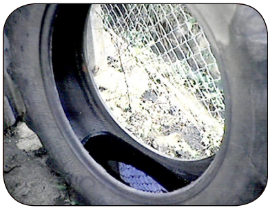
Recycle used tires or keep them protected from rain.