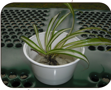
Put plants in soil, not in water