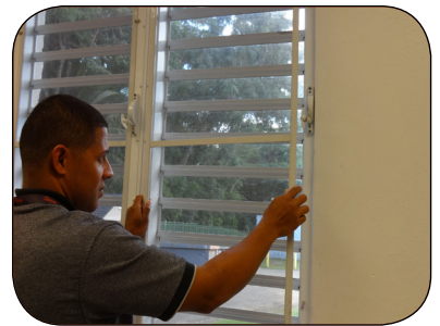
Install or repair window & door screens.