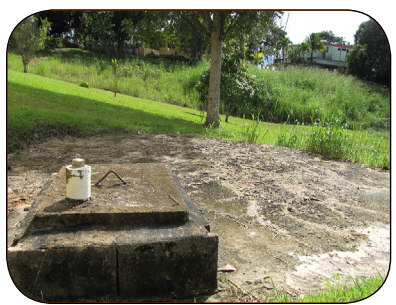
Keep septic tanks sealed.