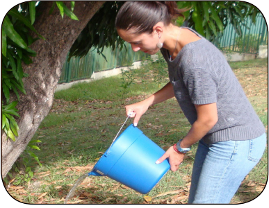
Drain & dump any standing water.