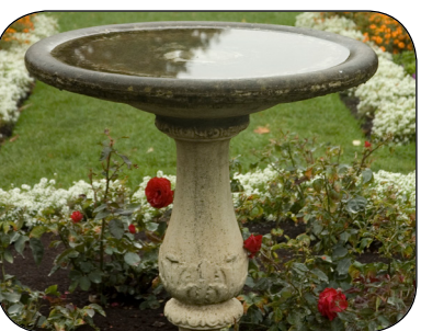
Weekly, empty standing water from fountains and bird baths.