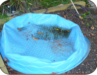
Drain water from pools when not in use.