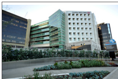
Cedars-Sinai Medical Center, Los Angeles.

AFFILIATIONS: Martens' goal was to cultivate external local and national partnerships to advance the wellness program. For example, he partnered with several local health and nutrition facilities to offer discounted rates to Cedars-