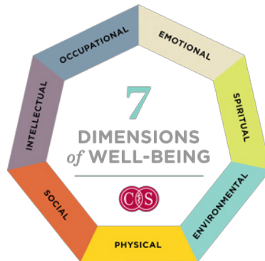
Cedars-Sinai's multidimensional model of well-being.