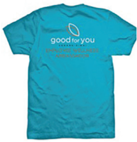
Cedars-Sinai employee wellness ambassador t-shirt.

messages and activities. The Work@Health® program highlighted the power of having champions from all levels of the organization serve as role models, resources, and program advocates. Martens developed a communication plan that outlined the ambassadors'