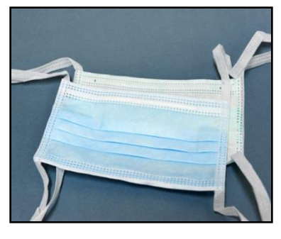
Nose + Mouth