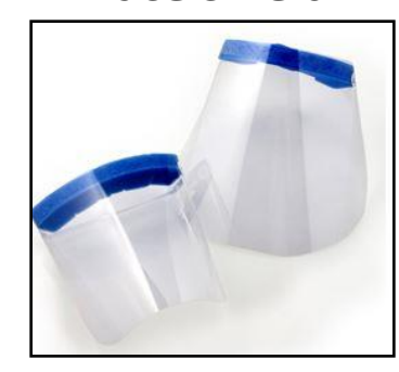
Eyes + Nose + Mouth