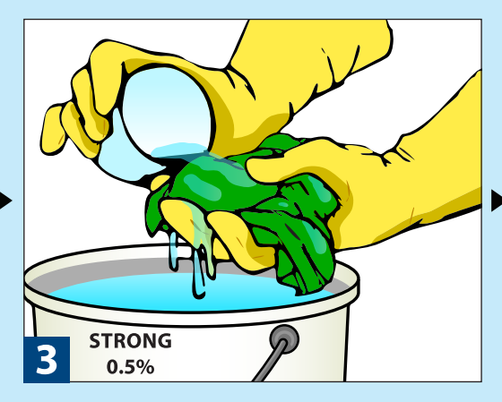
Pour STRONG chlorine water onto clean cloth.