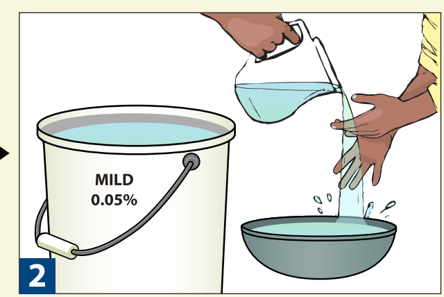
Use the MILD chlorine water to wash hands.