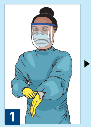
Before starting, put on your gown, mask, face shield, and two pairs of gloves.

Use the STRONG chlorine water to clean floors, latrines, tables, and mats touched with blood, vomit, poo-poo, pee-pee, snot, spit, or sweat. Make new STRONG chlorine water every day.