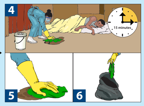
Put soaked cloth on top of spill. Let sit for 15 minutes. Then clean up and throw in waste bag.