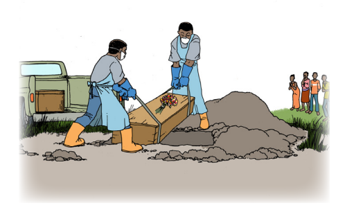
Bury all dead bodies safely.