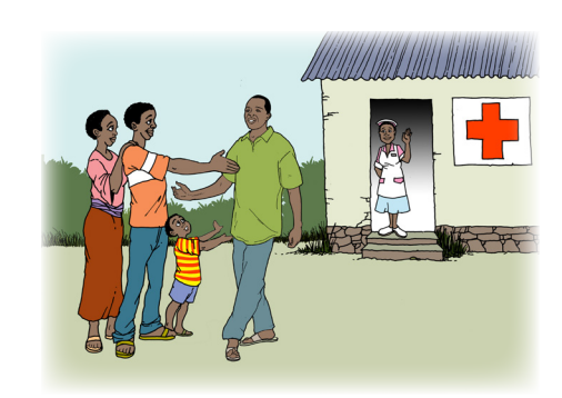
Ebola survivors are safe to be around. Support them in your community.