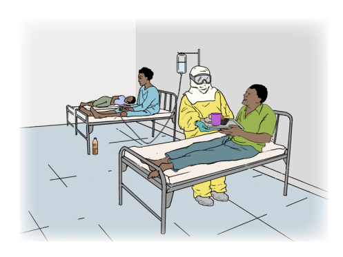
Health workers in the treatment center are there to help you.