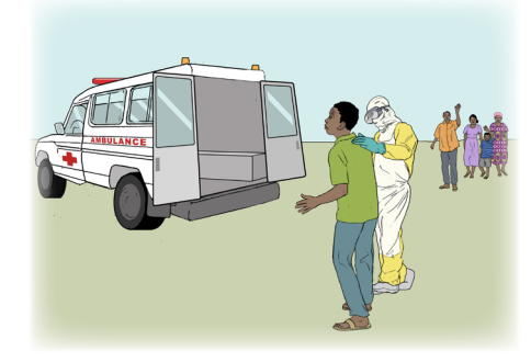
Get care early if you develop symptoms.