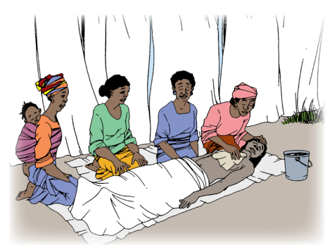
Don't touch the body of someone who has died of Ebola.