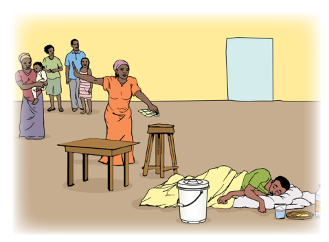
Separate sick family members