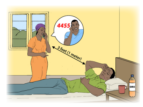
Call 115 in Guinea if you have symptoms of Ebola.