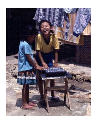
Children using SODIS PUR<sup>TM</sup>