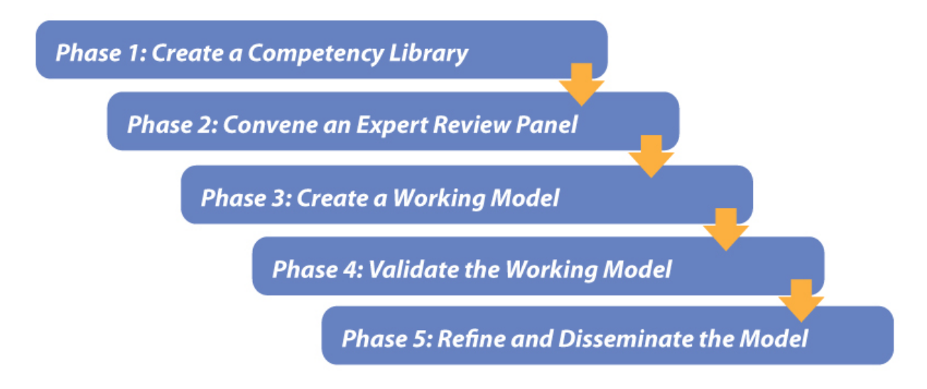
Figure 2. Process used to develop PHLCM

The PHLCM developers followed best practices delineated by relevant academic and professional literature about competency modeling. A working model was developed through a deliberative process to build on and align with existing frameworks and models for competencies in the various public health professions and tracks. The project was completed over a three-year period, from 2013–2016, in the five phases presented in Figure 2.