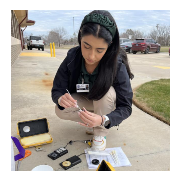
Associate at Chickasaw Nation Department of Health, 2022