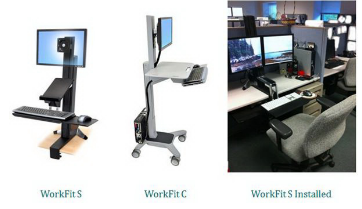
Figure 1. Sit-stand devices used in the Take-a-Stand Project, Minneapolis, Minnesota, 2011. [A text description of this figure is also available.]

The Take-a-Stand Project was a partnership among a sit-stand device manufacturer, Ergotron, Inc, Eagan, Minnesota; an employer, HealthPartners, a large nonprofit, member-governed health system in Bloomington, Minnesota; and the employees of the Health Promotion Department at HealthPartners in Minneapolis, Minnesota. Both Ergotron and HealthPartners have an interest in improving human performance through ergonomic and health-related solutions (15). Participating employees had the opportunity to comment on their interest in the timing and approach of the project and to share their experiences with the project.