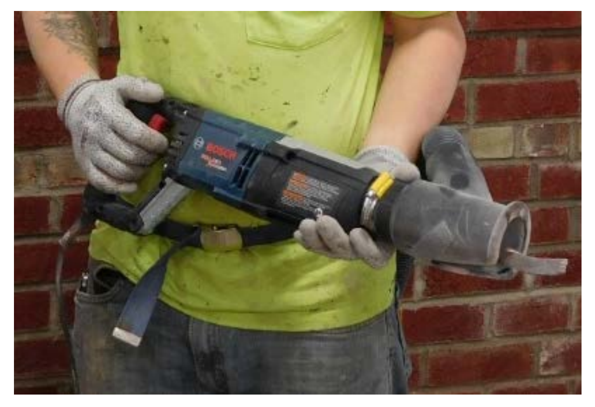
Figure 2 - Hammer drill with shroud and bit

An on-tool exhaust hood designed for hammer drills (suction casing 6621, Dustcontrol, Inc, Wilmington, NC) was attached to the front of the tool with a hose clamp. A triangular notch approximately 38 mm long at its base with sides approximately 80 cm long was cut into the hood to allow the hood to be flush with the wall when it was used for mortar removal. The diameter of the hood's flanged inlet is approximately 60 mm. The diameter of the tool connection is 48 mm and the diameter of the hose connection is 38 mm. The hood is shown in Figure 3.