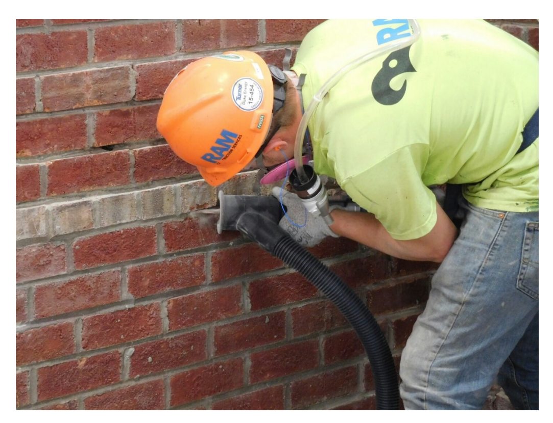
Figure 5 – Cyclone sampler in the breathing zone

The filter samples were analyzed for respirable particulates according to NIOSH Method 0600 [NIOSH 1998]. The filters were allowed to equilibrate for a minimum of two hours before weighing. A static neutralizer was placed in front of the balance and each filter was passed over this device before weighing. The filters were weighed on an analytical balance (model XP6, Mettler-Toledo, LLC, Columbus, OH). The sequence specific limit of detection (LOD) and the limit of quantitation (LOQ) were determined using the seven media blanks. The LOD is three times the standard deviation of the media blank weight differences. The LOQ is ten times the standard deviation of the media blank weight differences. The limit of detection (LOD) was 20 \mu g/sample. The limit of quantitation (LOQ) was 53 \mu g/sample.