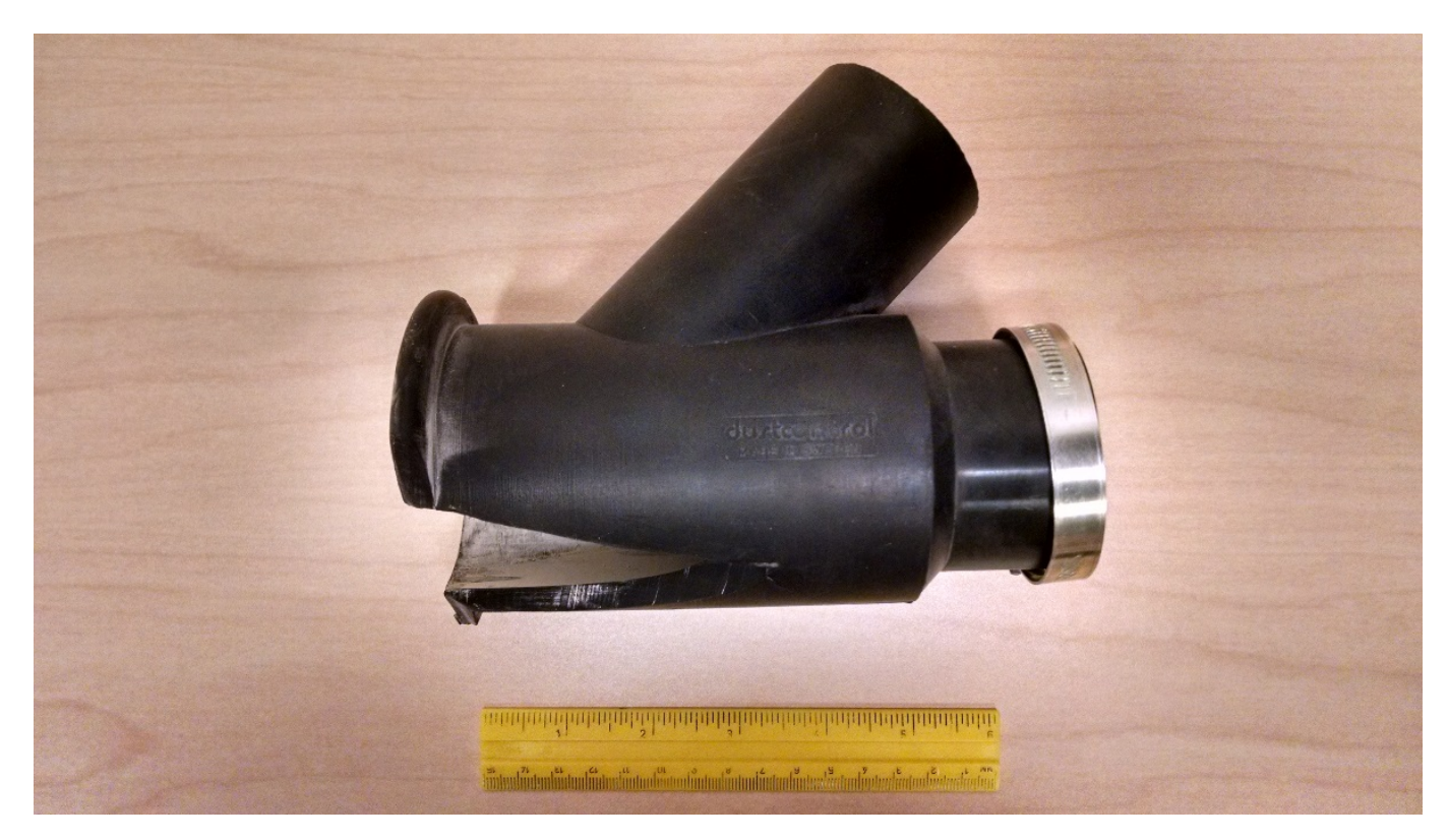
Figure 3 - On tool exhaust hood

The hood was connected to a pre-separator (model DC 2800, Dustcontrol, Inc., Wilmington, NC) with a 4.6 m length of 38 mm diameter vacuum cleaner hose. A length of 50 mm diameter hose linked the pre-separator to a vacuum cleaner (model DC 2900c eco, Dustcontrol, Inc, Wilmington, NC) equipped with a part number 42029 prefilter and part number 42027 class-H<sup>2</sup> final filter (Dustcontrol, Inc, Wilmington, NC). The pre-separator and vacuum cleaner are shown in Figure 4. The use of a cyclonic pre-separator reduces the accumulation of dust and debris on the filter in the vacuum cleaner, which helps to maintain a steady airflow [Heitbrink and Santalla-Elias 2009]. The vacuum cleaner and pre-separator are shown in Figure 4. The pre-separator is the larger unit on the right.