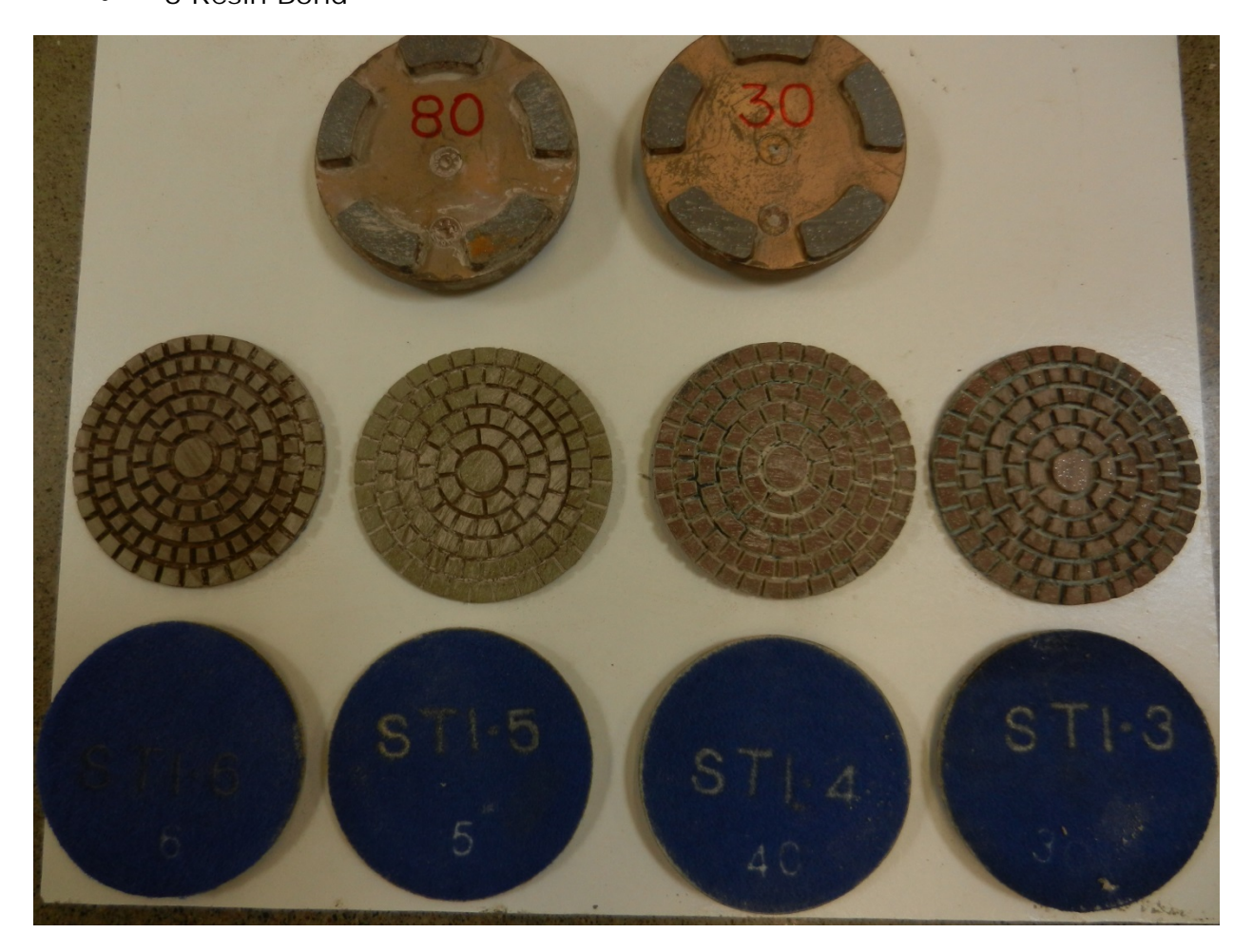
Figure 4: Different Grits used during the survey

Two personal DataRam (pDR, model 1000AN, Thermo Electron Corp., Franklin, MA) mounted on a tripod at breathing zone height (1.5 m) was used to verify that the room was ventilated and cleaned to background respirable dust levels, no greater than 0.05 mg/m³. Since there are no direct-reading instruments for respirable crystalline silica, using the crystalline silica REL as the respirable dust background level ensures that the background silica concentration will be lower than the NIOSH REL.