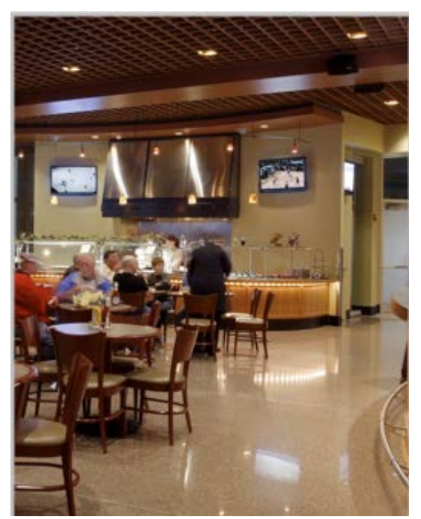
Figure 1: A polished concrete floor

Crystalline silica is a constituent of several materials commonly used in construction, including brick, block, and concrete. Many construction tasks have been associated with overexposure to dust containing crystalline silica [Chisholm 1999, Flanagan et al. 2003, Rappaport et al. 2003, Woskie et al. 2002]. Among these tasks are tuckpointing, concrete cutting, concrete grinding, abrasive blasting, and road milling [Nash and Williams 2000, Thorpe et al. 1999, Akbar-Khanzadeh and Brillhart 2002, Glindmeyer and Hammad 1988, Linch 2002, Rappaport et al. 2003]. Colored, stained, and polished concrete floors are increasingly popular for use in homes, offices, retail establishments, schools, and other commercial and industrial settings. For example, some a major chain store has specified integrally-colored concrete floors in its new stores in place of vinyl composite tile. Polished concrete floors are durable, sanitary, and easy to maintain (Figure 1).