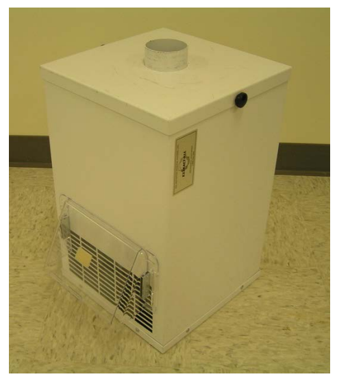
Figure 4: Exhaust system #1