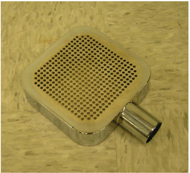
Figure 9: Rectangular side exhaust hood

<u>C. Rectangular side draft exhaust hood (6" x 6" x 1.5")</u> Hood face inlet area of 0.0525 ft^2