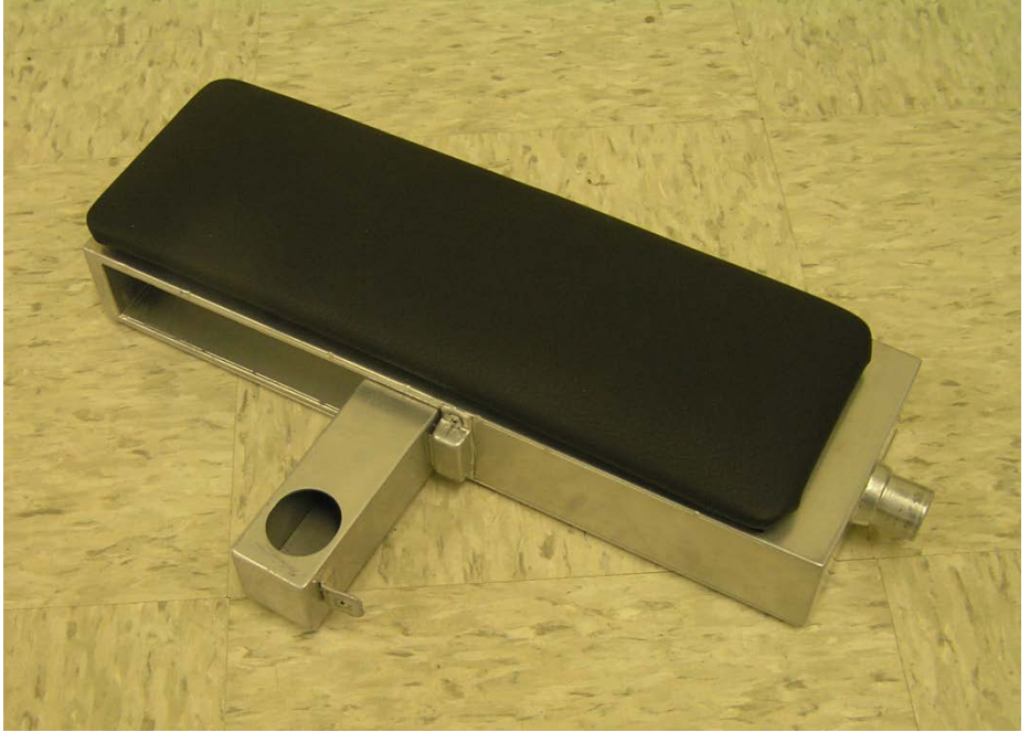
Figure 10: Hand rest exhaust

D. Hand rest with an exhaust hood for nail products Hand rest dimensions (1.33 ft. x 0.42 ft.) Hood face inlet area of 0.0104 ft^2 .