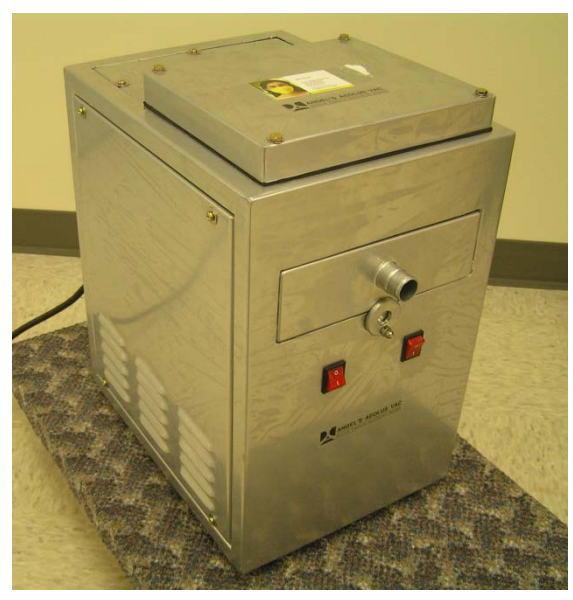
Figure 6: Exhaust system #3

Four (4) collecting hoods were evaluated in conjunction with the three exhaust ventilation systems. The combination of the three exhaust systems and the four collecting hoods resulted in a test matrix of twelve tests. A brief description of each collecting hood is provided below: