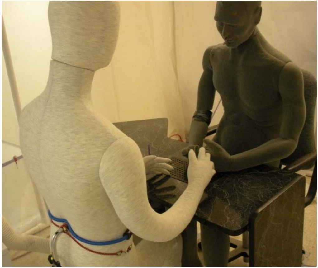
Figure 3: Experimental Arrangement

To prevent SF<sub>6</sub> from being re-entrained into the enclosure, the discharge from the local exhaust ventilation system was routed to an exhaust box that was then vented to the enclosure's ceiling exhaust. The exhaust box was constructed of Plexiglas with the dimensions of 3.04 \times 2.56 \times 5.06 feet.