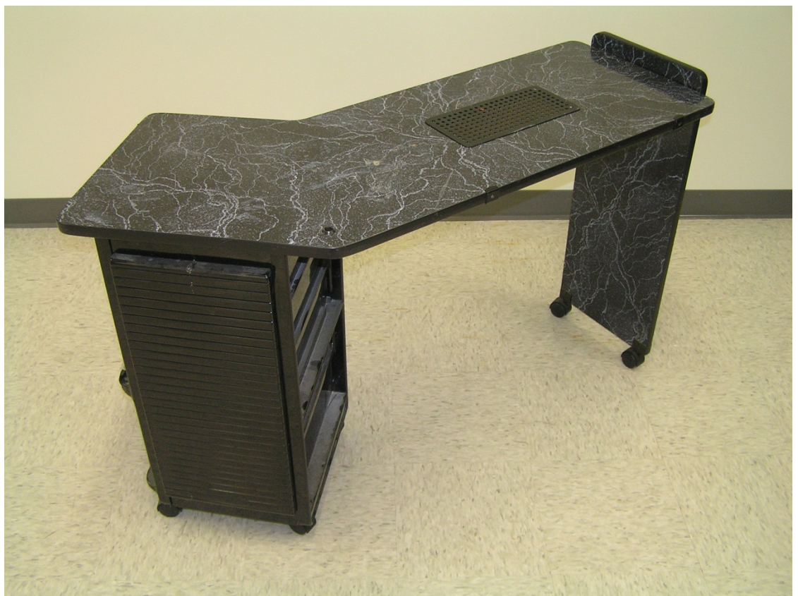
Figure 2: Nail Salon Table

To quantitatively evaluate the capture efficiency of the ventilation system, a tracer gas method was used. Tracer gas is commonly used to evaluate capture efficiencies of local exhaust ventilation systems. One of the most common applications of tracer gas testing occurs in fume hood testing for local exhaust ventilation hoods that are designed to capture both gases and particles [ANSI/ASHRAE 1985].