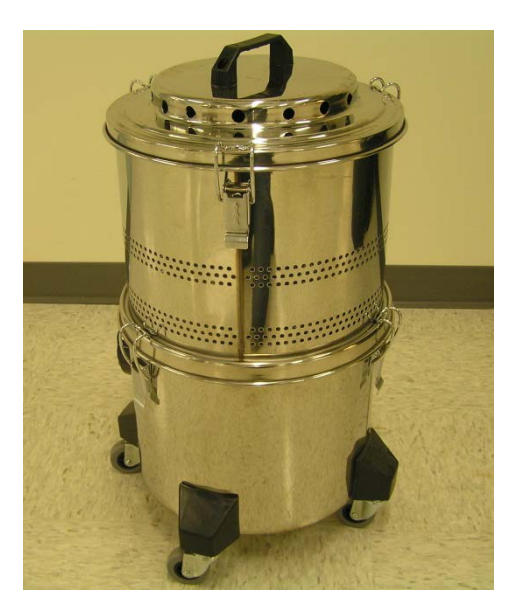
Figure 5: Exhaust system #2