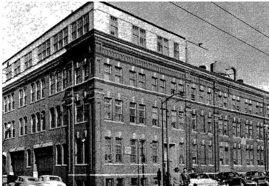
Figure 4-1: The Hood Building at MIT

The Hood Building was acquired by the AEC for use by MIT in performance of Metallurgical Project 6825. The Hood Building was constructed in the early 20 th century and served as an ice cream plant and warehouse for the Hood Milk Company. The building was located at the intersection of Massachusetts Avenue and Albany Street (155 Massachusetts Avenue) in Cambridge. While the building was owned by AEC, MIT assigned Building Number 12 for identification. A photo of the building is provided in Figure 4-1.