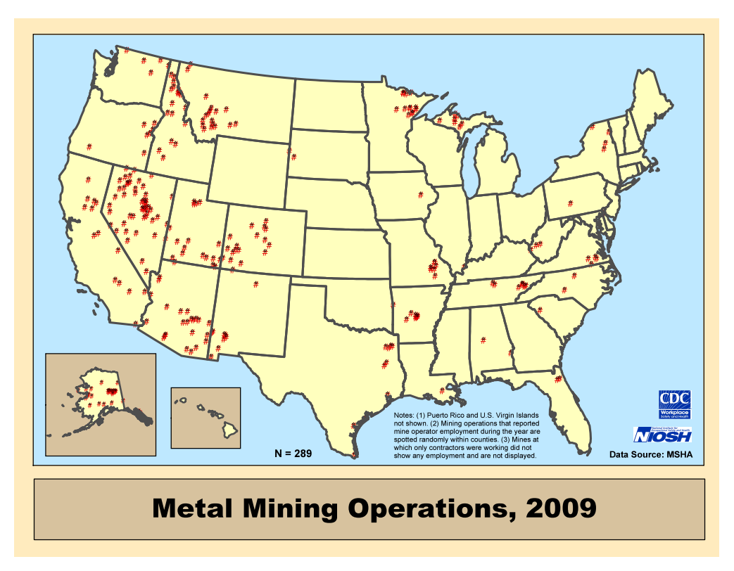
Figure 2. U.S. Base and Precious Metal Producing areas. Includes gold (lode and placer), copper ore, iron ore, lead and/or zinc ore, uranium, silver ore, alumina (mill), aluminum ore, manganese, molybdenum, rare earths, titanium, nickel, uranium-vanadium ores, platinum group, zircon, tungsten, vanadium, beryl, and tin ore.

The map (the same one presented in the base metal section) shows where base and precious metals are mined in the U.S.