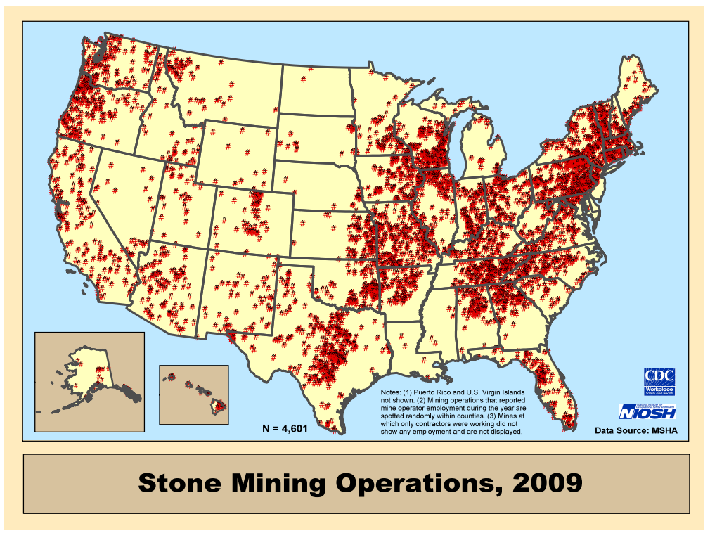
Figure 4. U.S. stone mining operations (includes limestone, granite, traprock, sandstone, stone, dimension, lime, slate, and marble).