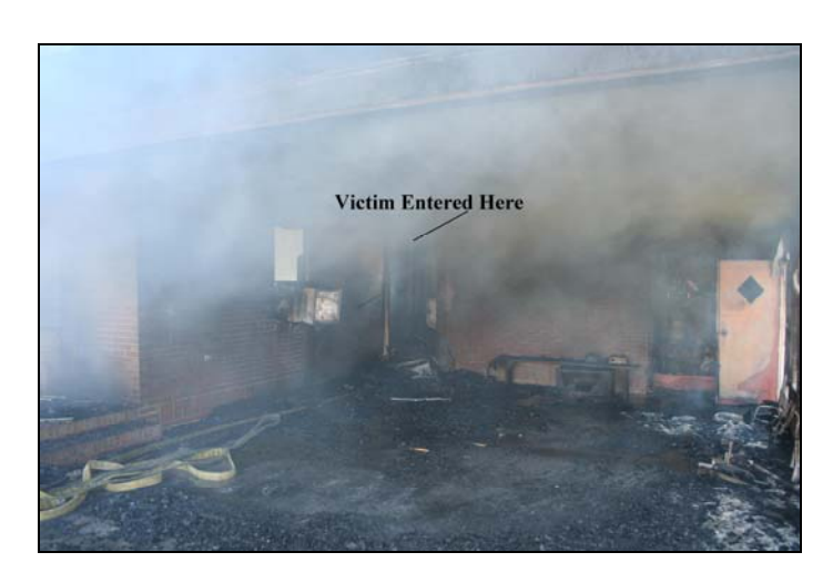
Photo 3. Door under carport that victim entered through.