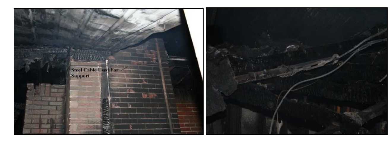
Photo 1. Steel cable used to support the chimney against the house with a turnbuckle.

turnbuckle to connect the cable ends; this supported the chimney while pulling it back against the house (see Photo 1).