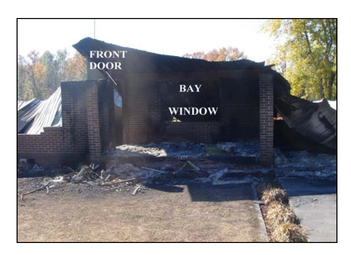
Photo 4. Incident scene after rekindle and collapse showing the front door and bay window.

Moments after FF2 left with the flashlight, FF1 reported hearing the victim radio him and stating, "...at front door, can't get it opened." Note: This was not heard on the 911 dispatch tape by NIOSH investigators and is believed to have been on a non-recorded fire department talk around channel. FF1 retrieved an axe from AE2 and donned his SCBA over his bunker gear. He ran to the front porch and found the screen and exterior doors locked. He yanked the screen door off the frame and punched the exterior door open with the head of the axe. He was met with thick black smoke causing him to step back and clean the soot from his face piece. He then stood in the doorway yelling for the victim. FF1 then heard glass breaking from the bay window beside the front door. This window was between the front door and carport (see Photo 4).