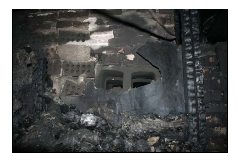
Photo 2. The picture shows the area of the brick chimney flue that was replaced with cinder blocks. The cinder blocks allowed heat and flame to impinge on the exterior wall allowing fire to spread into the attic space.

After the chimney was repositioned, the owner noticed that bricks from the chimney's flue had cracked and shifted. The owner removed the damaged bricks and replaced them with hollow cinder blocks. These blocks had been laid with the hollows horizontally positioned towards the attic space (see Photo 2). The residents of the house were safely evacuated prior to the fire department's arrival. The structure was completely destroyed by a rekindle several days later.