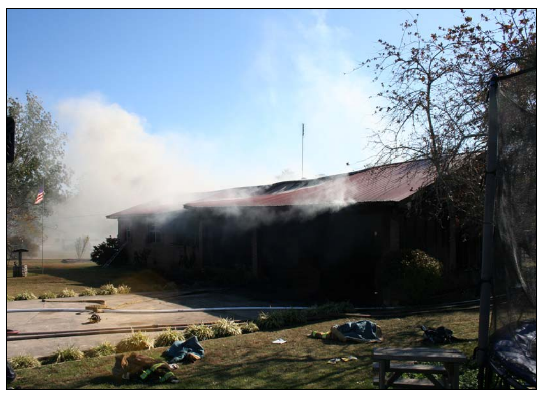
Incident Scene after Victim Removed