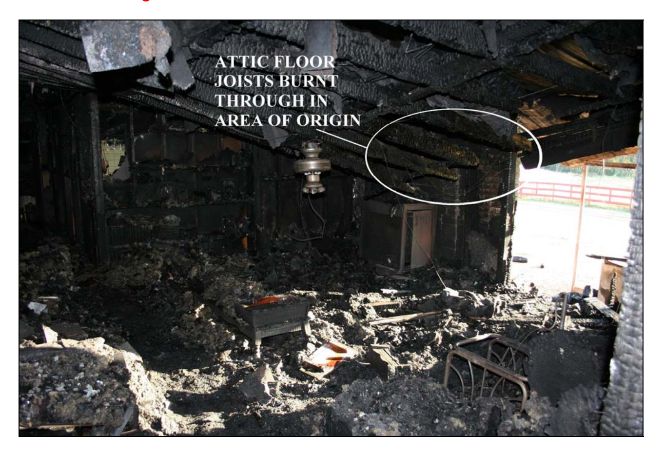
Photo 6. Fire damage to living room area before rekindle and structural collapse.