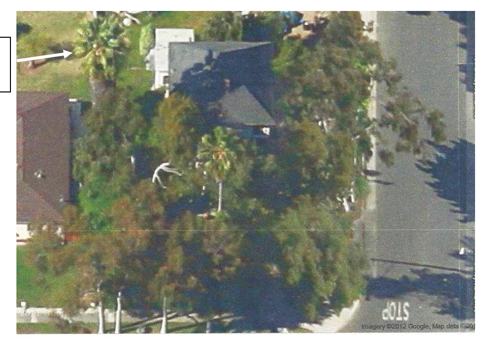
Exhibit 1. An aerial view of the private residence where the incident occurred.