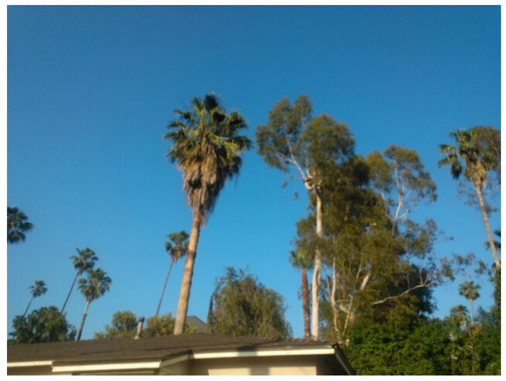
Exhibit 3. A view of the palm tree from the neighbor's driveway.