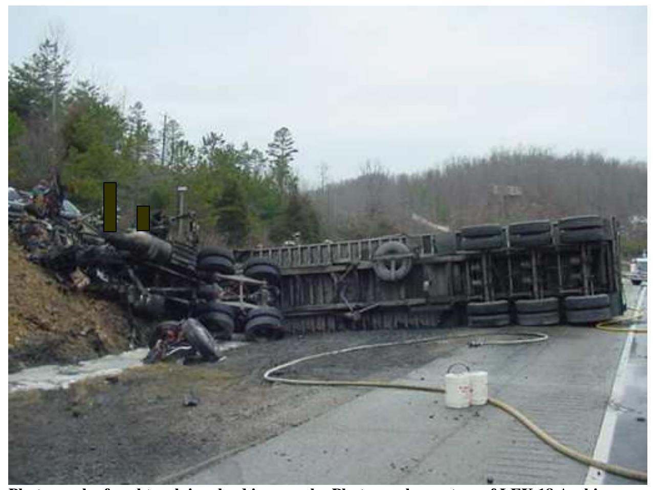
Photograph of coal truck involved in a crash.

Kentucky Fatality Assessment and Control Evaluation Program Kentucky Injury Prevention and Research Center 333 Waller Avenue Suite 206