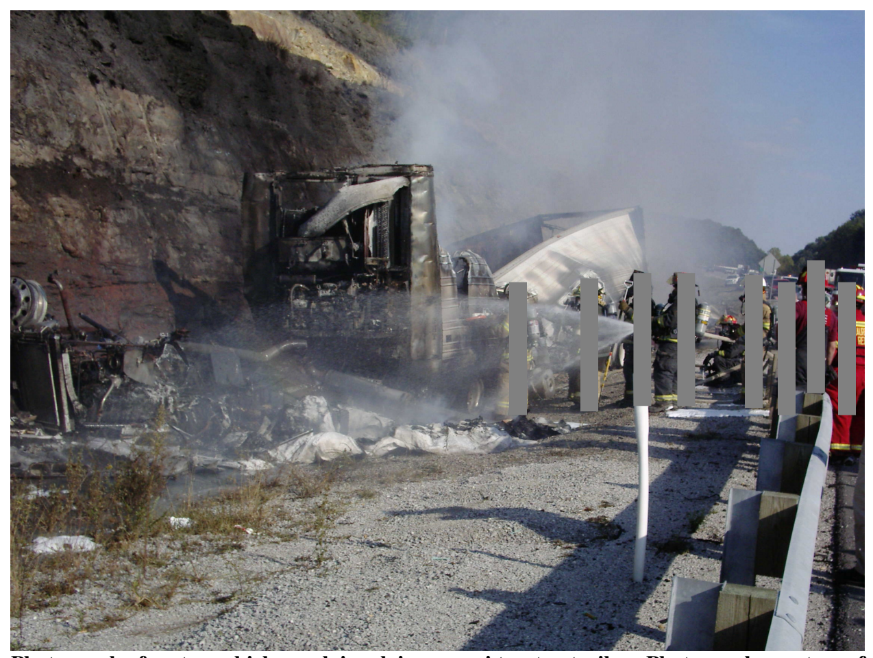
Photograph of motor vehicle crash involving a semi tractor-trailer.

Kentucky Fatality Assessment and Control Evaluation Program Kentucky Injury Prevention and Research Center 333 Waller Avenue Suite 202