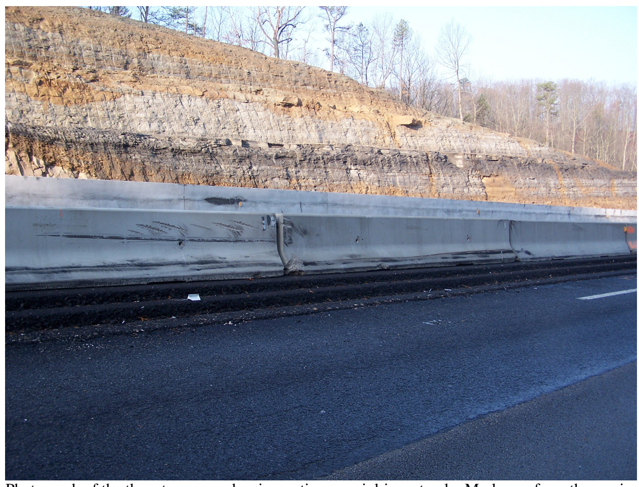
Photograph of the three temporary barrier sections semi driver struck. Marks are from the semi.