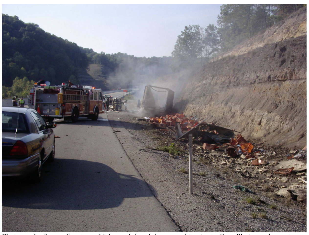
Photograph of rear of motor vehicle crash involving a semi tractor-trailer.