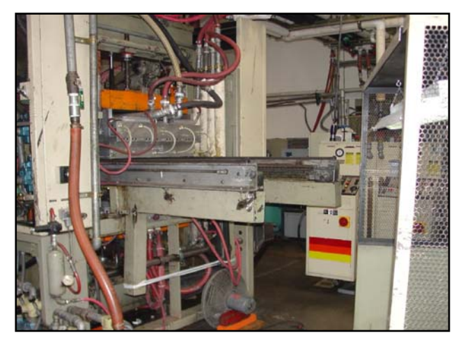
This front view of the plastic thermoformer machine shows where the set-up worker was making adjustments to the top platen, while the machine operator was working in the rear of the machine to adjust the oven. The pneumatic hose on the left of the machine remained energized during the adjustments.

The coworker activated the toggle switch on the pneumatic valve to lower the top platen 4-8 inches, leaving an 8-inch