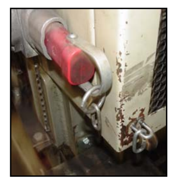
One of the disconnected safety interlocks on the thermoform machine would have prevented start-up if a gate was open.

Training on lockout/tag out procedures should include specific procedures for each machine. Written hazardous energy programs and training must include the manufacturer's operating instructions. A machine operator should be aware of and follow all of the manufacturer's instructions and safety recommendations.