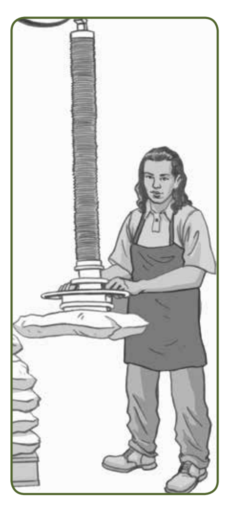
Figure: An employee operating a pneumatic lift and moving device. More details on Page 11, Figure 9.