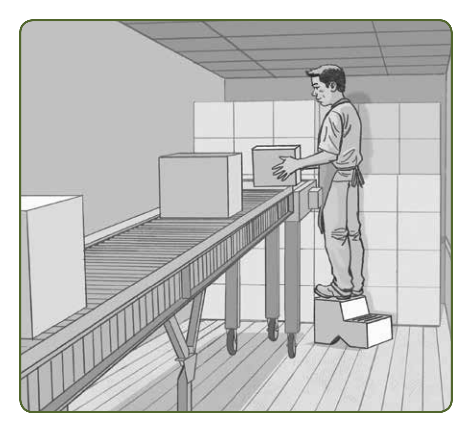
Figure 2 shows an example of a height-adjustable conveyor. With this type of conveyor, one person can do what two or more individuals normally do in unloading a trailer. Height adjustable conveyors can also reduce extreme bending and allow the boxes to be placed on the conveyors rather than dropped which could damage the container and/or contents. A sturdy step stool or platform is needed to reach the top levels of the interior of the trailer, which range from 7.5 feet (2.3 m) to 9.0 feet (2.7 m) high.