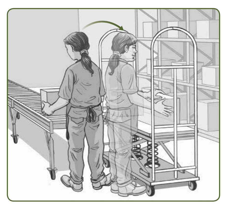
Figure 4 shows an employee in two positions as she unloads boxes from a conveyor onto a U-Boat platform truck in which a spring-loaded platform has been added. In the first position she is grasping the box. In the second position she turns her feet and body to face the platform truck. The U-Boat outfitted with spring loaded platform is designed to reduce bending by keeping the load at or near waist height either when loading or unloading containers. The narrow platform deck reduces excessive reaching.