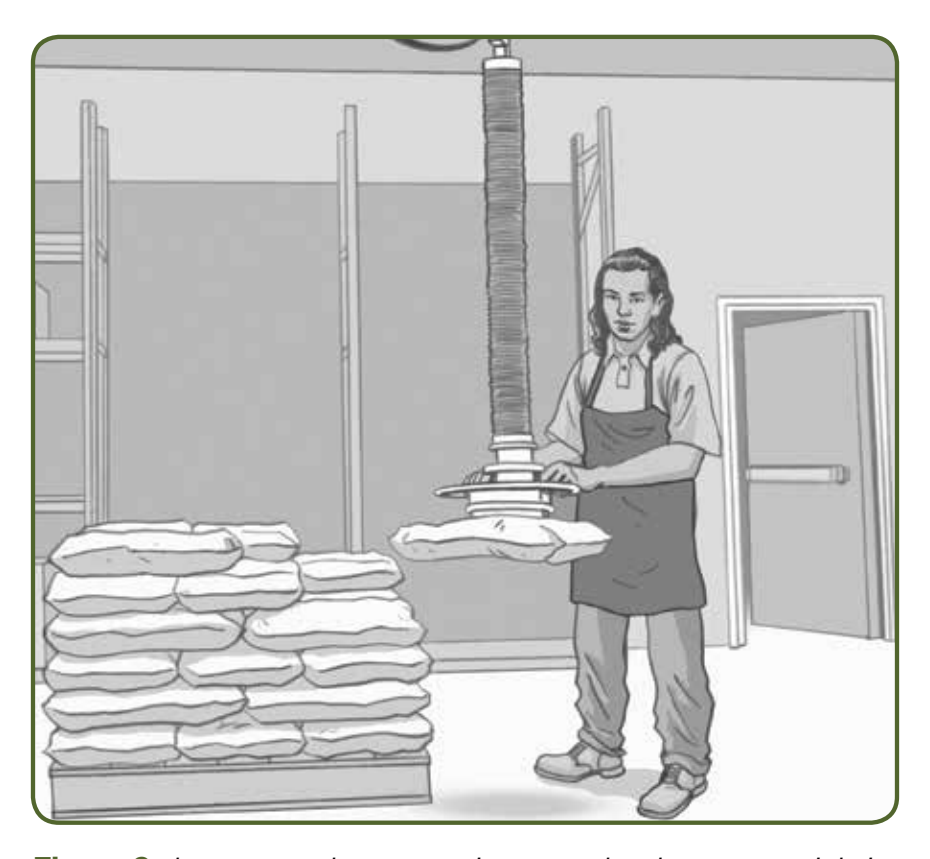
Figure 9 shows an employee operating an overhead vacuum or air hoist to move large bags of materials to flat carts or pallets (not shown). A vacuum lift device can alleviate the repetitive stress of lifting and moving of unstable materials. A main advantage is the lifting task can be done in less time by nearly any employee regardless of size and strength, thus increasing productivity.