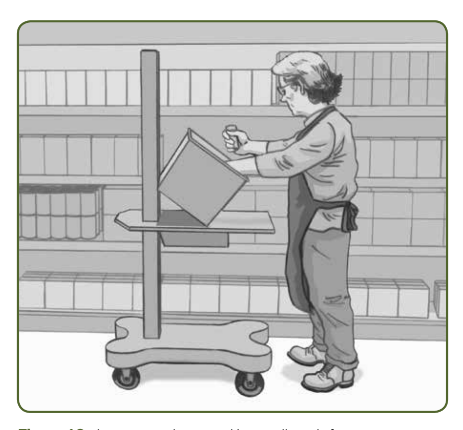
Figure 13 shows an employee stocking small goods from a tote (container) held in position by the stocking cart. By tilting the tote, awkward postures involving the shoulders, arms, and wrist are reduced, which lessens muscle fatigue and improves productivity. This type of stocking cart is particularly useful in stores where small items are stocked and sold, such as in the health and beauty aids departments in grocery stores.