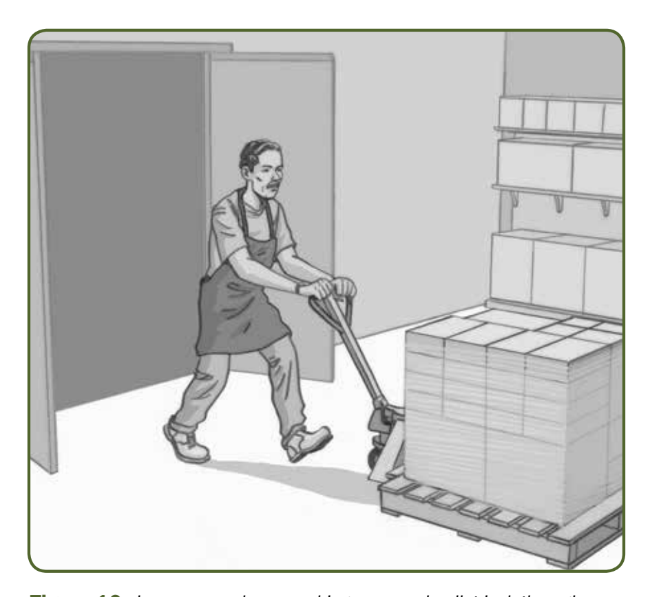
Figure 10 shows an employee pushing a manual pallet jack through the doors separating the stock area from the sales area. Pallets jacks or trucks are designed to lift and move a pallet. Although the pallet is able to hold large amounts of stock, thus reducing the number of trips between the back room and sales floor, pallets can pose a trip hazard to those in the immediate area, as well as blocking customers' access to the products.