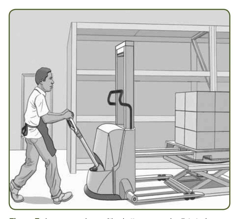
Figure 7 shows an employee with a battery powered pallet stacker picking up a full pallet. The full pallet is resting on a height-adjustable, pallet-loader table. The task here is either to move the full pallet to the sales floor or to move the pallet to a storage area away from a busy work area. The pallet stacker is designed to place a full pallet on a shelf for easy retrieval at a later time.