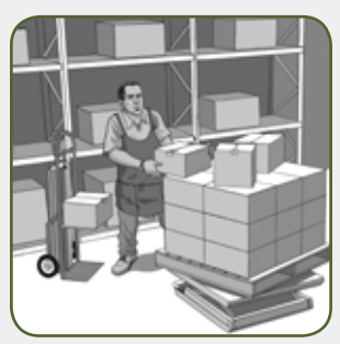
Transport and unload merchandise onto storage racks