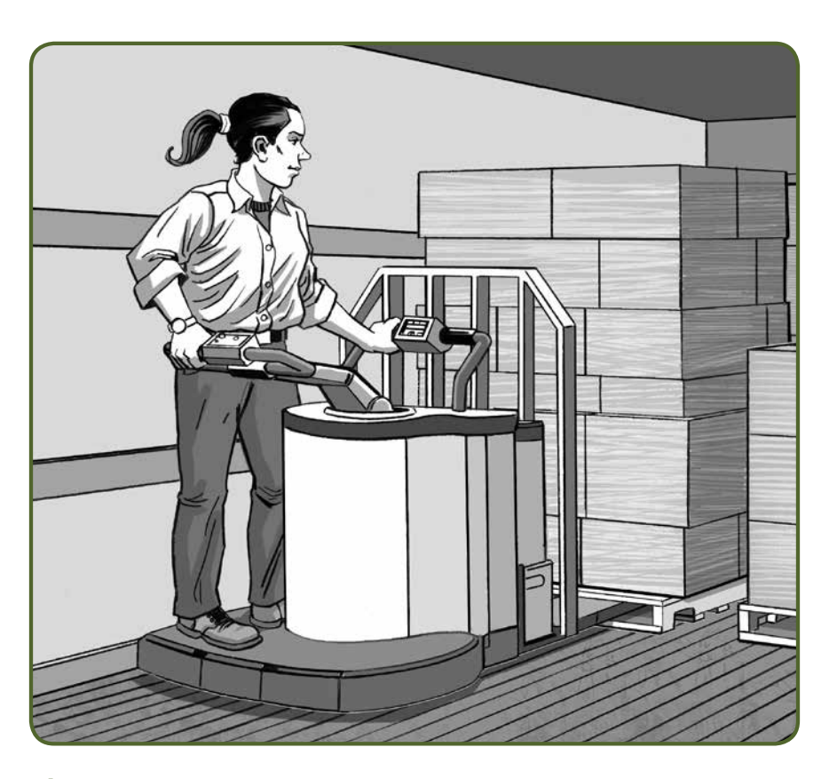
Figure 1 shows an employee unloading a trailer stocked with pallets of merchandise using a powered-pallet mover with a riding platform. Although, the device reduces the risk of material handling injuries, it does pose an added risk of a contact-with-object injury, such as bumping into the side of the trailer. Training is required to enable the operator with a loaded pallet to move safely across the loading dock's threshold into the facility's receiving area.