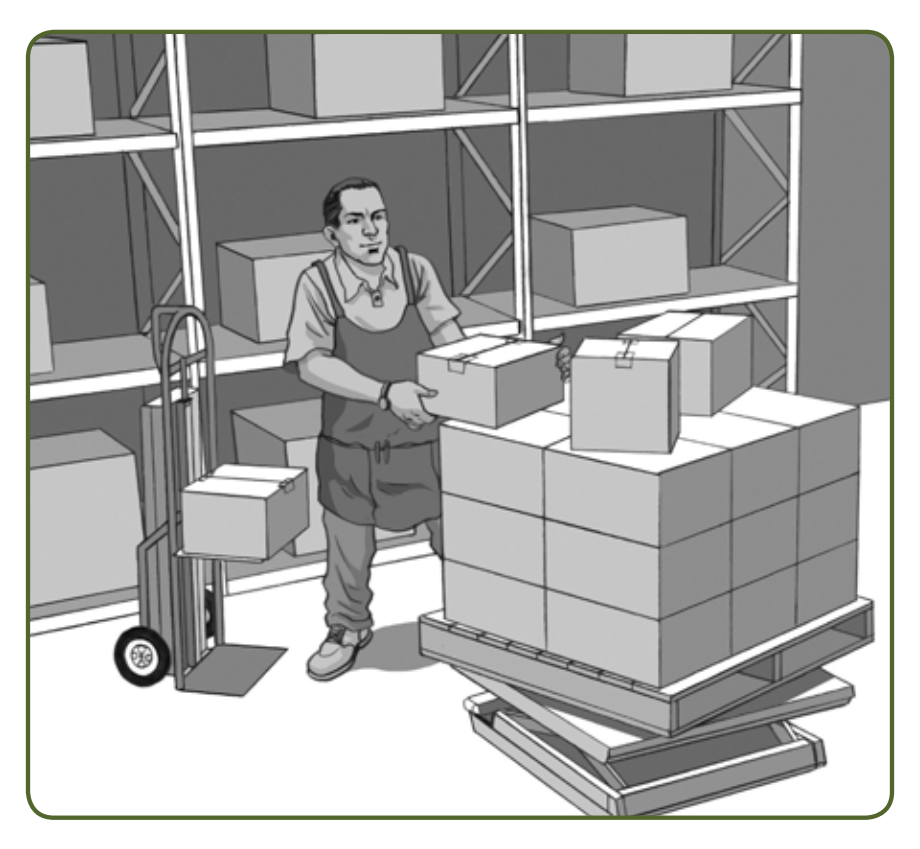
Figure 5 shows an employee unloading boxes from a pallet onto a powered adjustable handcart. The pallet is resting on a rotating and adjustable base that may be adjusted mechanically or pneumatically to set the height at waist level. The turntable minimizes reaching across or walking around the pallet.