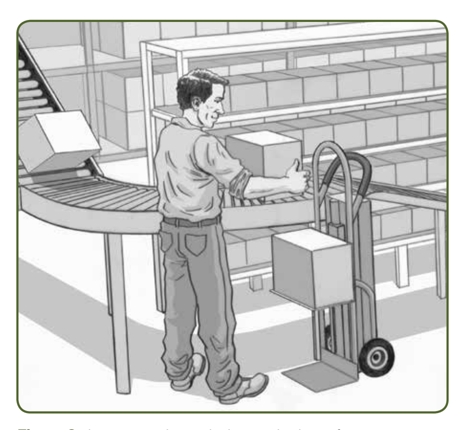
Figure 3 shows an employee who is removing boxes from a conveyor to load on a two-wheeled, self-adjusting handcart. Handcarts of this type are used frequently in moving beverages and containers of similar weights. In addition to saving time, adjustable handcarts reduce bending by keeping the load at or near waist level. Most adjustable handcarts operate with a spring or counterbalancing system.