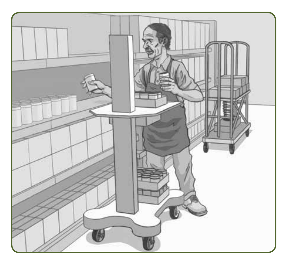
Figure 11 shows an employee with the aid of a stocking cart placing products on the store shelves using both hands, which increases his efficiency. This device was also designed to reduce excessive bending, holding, and reaching when stocking shelves. The top shelf slides up and down to keep the shelf at a better position for stocking shelves, while minimizing excessive bending.