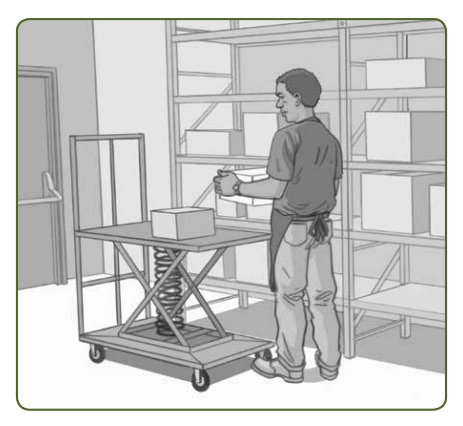
Figure 6 shows an employee unloading onto the storage shelves from a flat cart, outfitted with a spring-loaded platform. The intent of this device is to reduce excessive bending in loading and unloading materials located at or near the bottom of the flat cart. Best practices suggest stocking lighter weight goods on the lower level shelves. Knee pads are also an option if kneeling is required to stock lower shelves.