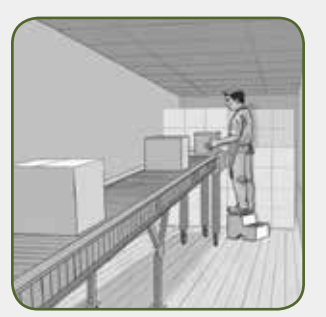
Unload truck and transport merchandise to the store using a conveyor