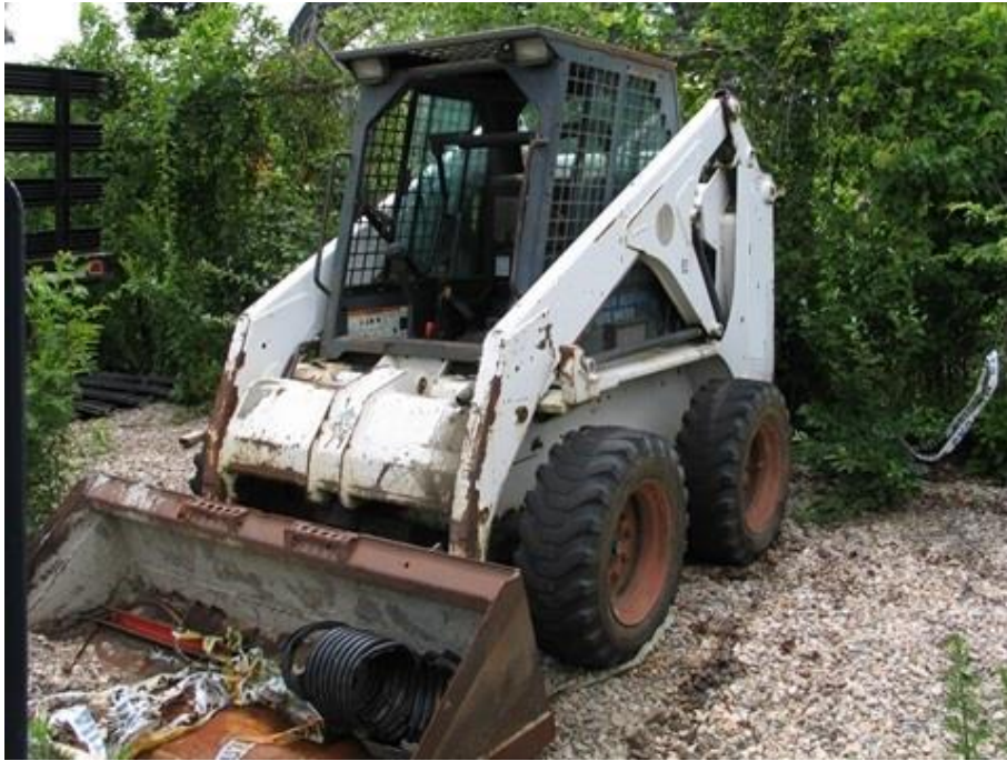
Figure 4 – Skid-steer loader's seat bar and lever controls