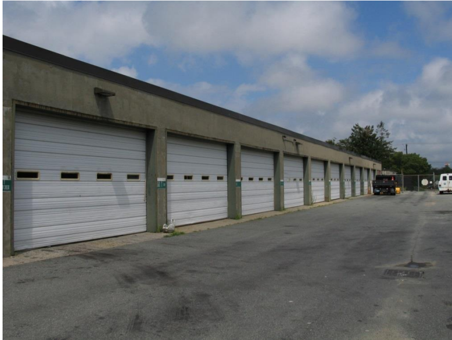
Figure 2 – Incident location with overhead garage door open