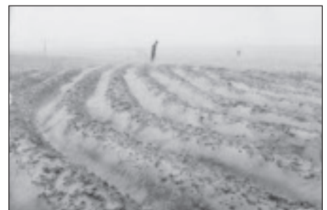
Oklahoma "Dust Bowl" during the 1930s. Many people contracted dust pneumonia throughout the Great Plains states during this time, although verification of official death rates is difficult to find.