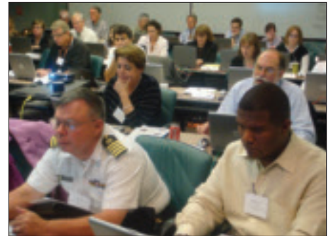
Public Health Effects of Drought Workshop held September 2008 in Atlanta, sponsored by CDC, U.S. EPA, and AWWA.