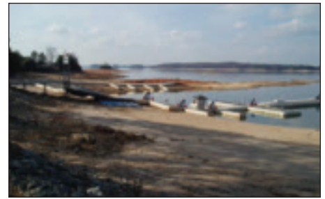
Lake Lanier, Georgia (December 2007). Several states in the southeastern part of the United States have experienced prolonged drought conditions during the last few years.