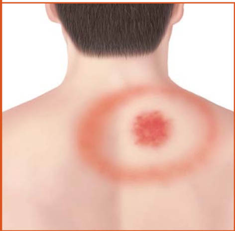
Bull's eye rash on the back.