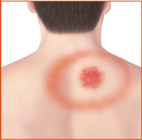
Bull's eye rash on the back.