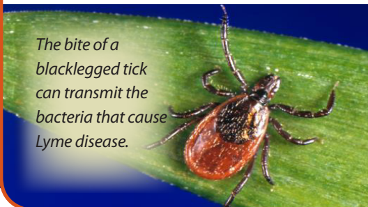
The bite of a blacklegged tick can transmit the bacteria that cause Lyme disease.