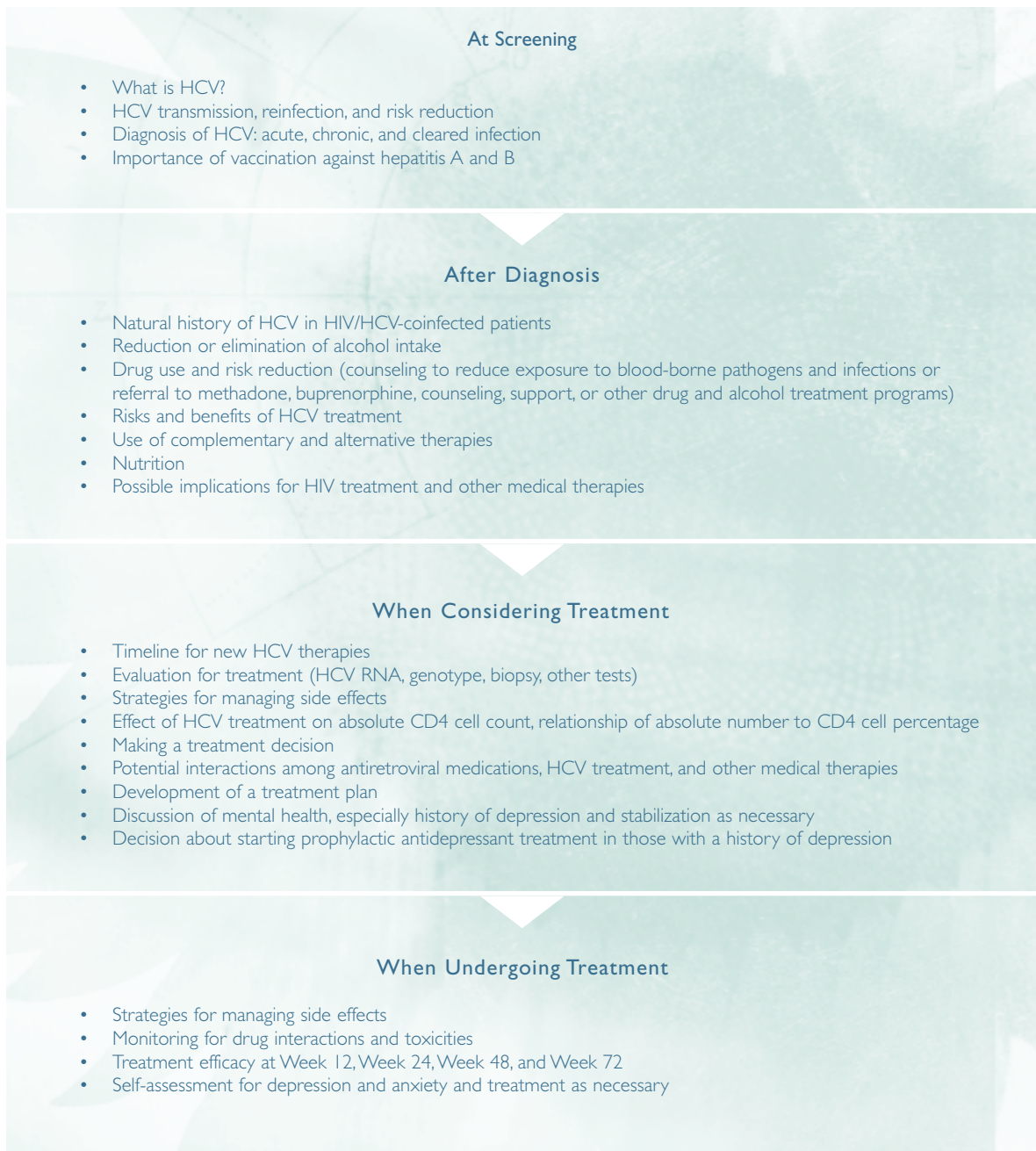
Figure 4. Essential Elements of HCV Education and Support