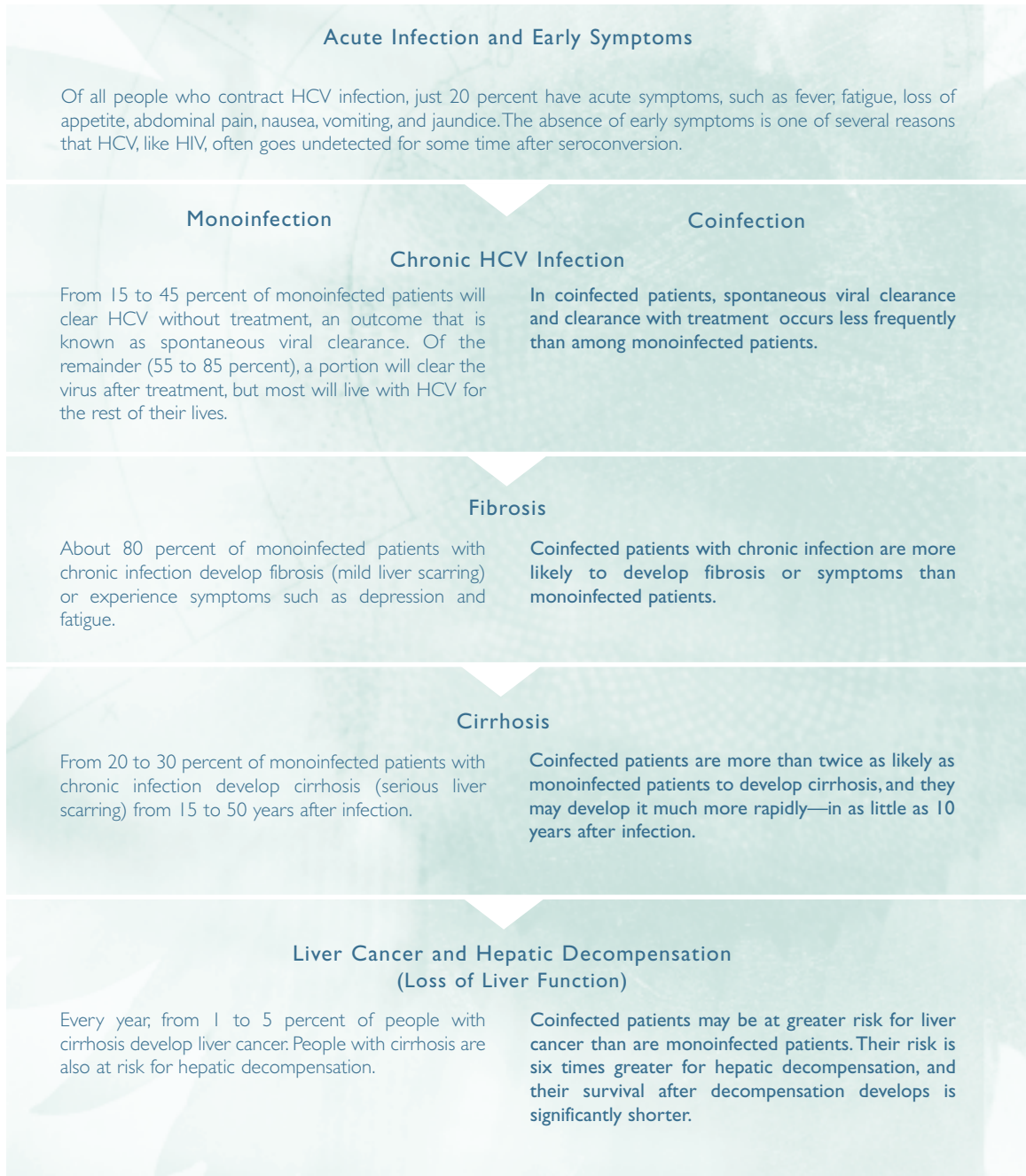
Figure 2. Natural History of HCV and Effects of Coinfection