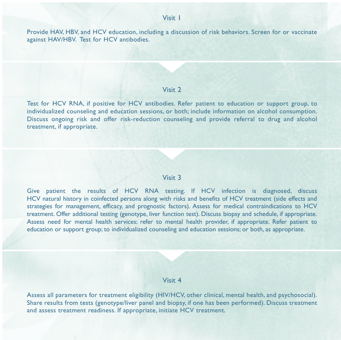
Figure 5. Multiple-Visit Model for Providing HCV Care and Assessing Treatment Options