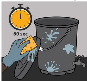
Apply disinfectant<sup>2</sup> to both the inside and outside of the cleaned water container using a clean sponge or cloth. Let some disinfectant drain through the tap. Leave all surfaces wet with disinfectant for at least one minute.