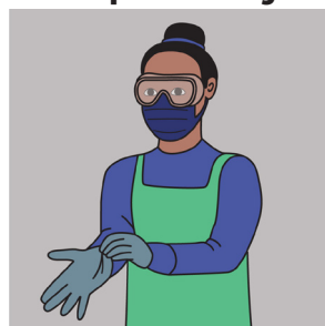
Put on PPE: rubber gloves, an apron, a face mask and googles or a face shield.