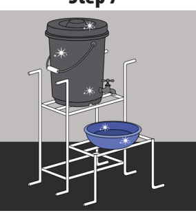
Fill the container with clean water. Monitor the cleanliness of the water container throughout the month; repeat cleaning and disinfection if needed.