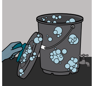
Scrub<sup>2</sup> the water container with soap/detergent and water or soapy water using a clean brush or sponge. Remove all visible dirt from the inside and the outside of the container. Drain the soapy water through the tap.