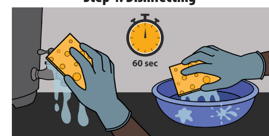
Apply disinfectant <sup>1</sup> to the cleaned tap and the inside and outside of the cleaned catchment basin using a clean sponge or cloth. Leave all surfaces wet with disinfectant for at least one minute. Rinse with clean water and let air dry. Remove PPE and wash hands with soap and water.