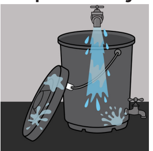
Rinse the water container with clean water. Drain the rinse water through the tap.