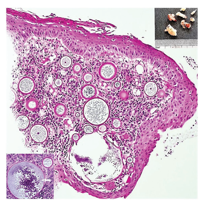
Figure 1. Results of testing in a 24-year-old Black woman with rhinosporidiosis, South Africa. Squamous mucosa with numerous thick-walled sporangia in the subepithelial region amid subacute inflammation. Hematoxylin and eosin stained section; original magnification ×100. Upper right inset shows polypoid solid fragments of tissue; lower left inset depicts sporangia enclosing endospores maturing centripetally (white arrow). Insets: original magnification ×200.

Rhinosporidium grows slowly in host tissues, so infection and clinical manifestations may be temporally distant. Patients with nasal or nasopharyngeal lesions manifest intermittent epistaxis, nasal obstruction, nasal mass, or nasal discharge (3,4). Clinical differential diagnoses include neoplasms, nasopharyngeal carcinomas, inverted papillomas, primary sinonasal tuberculosis, and nasal angiofibromas (5). Diagnosis of rhinosporidiosis is made histologically; sections show