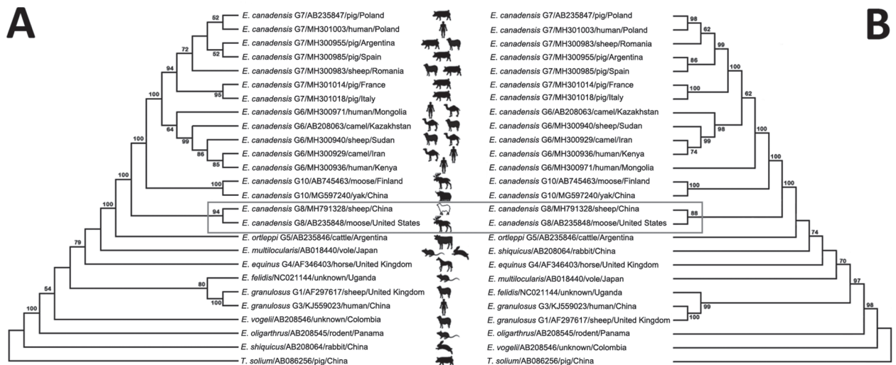
Figure. Phylogenetic analysis of Echinococcus species of different genotypes, strains, and host origins, including the E. canadensis G8 tapeworm identified in a sheep in China, 2018. Phylogenetic trees were inferred by maximum-likelihood analysis on the basis of concatenated amino acid data of 12 protein-coding genes by using the Jones-Taylor-Thornton model (A) and concatenated nucleotide data of 12 protein-coding genes by using the Tamura-Nei model (B) in MEGA7.0 ( https://www.megasoftware.net ). The reference species Taenia solium was used as the outgroup. We performed bootstrapping with 1,000 replicates to calculate the percentage reliability for each node in both data sets; only values of \geq 50\% are shown. Tree branch lengths are proportional to the evolutionary distance. The box contains the E. canadensis G8 tapeworm identified in this study (GenBank accession no. MH791328) and its closest relative from a moose in the United States (GenBank accession no. AB235848). Sheep shown in white represents a potential new intermediate host of E. canadensis G8.