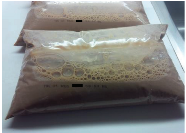
Figure 2. Bags of pasteurized chocolate milk as sold in Canada, with outer bag containing brand information removed. A bag of milk similar to these, found at the home of 1 case-patient during investigation of an outbreak of Listeria monocytogenes infection associated with pasteurized chocolate milk in Ontario, Canada, was found to be contaminated with the same strain obtained from infected patients.

Brand B chocolate milk is a widely distributed product in Ontario, and contamination of this product could have resulted in >34 case-patients. It is possible that a lower number of case-patients were reported because chocolate milk may primarily be consumed by younger, healthier persons, in whom invasive listeriosis is less likely to develop (9). Another possible explanation is that the contamination in the milk