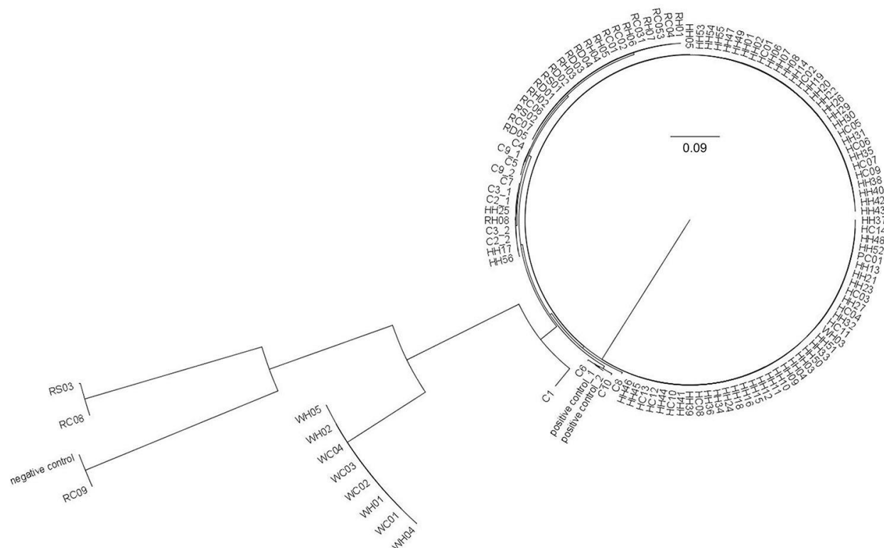
Appendix Figure 2. Phylogenetic tree generated using FastTree (Price et al. 2010) based on 37 single-copy housekeeping genes in amino acid space using PhyloSift (Darling et al. 2014). Sample names appended with “_1” and “_2” represent isolates sequenced in duplicate on two different MiSeq runs.