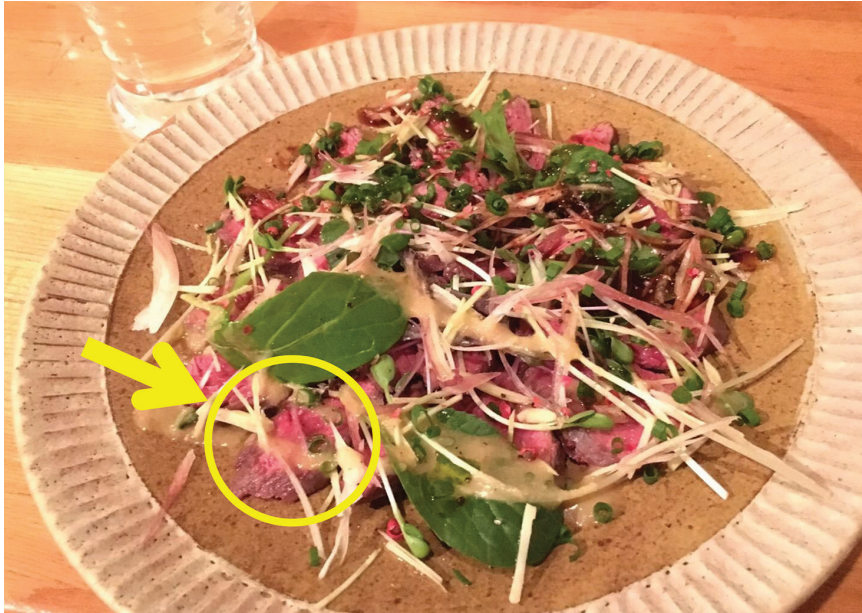
Figure 1. The bear meat dish implicated in an outbreak of Trichinella T9 infection, Japan, December 2016. Bear meat slices are marked with a circle and an arrow.

At the time of initial evaluation, the median eosinophil count was 1.0 \times 10^9/L (range 0.1 \times 10^9/L to 4.3 \times 10^9/L ), and the median creatine kinase level was 147 IU/L (range 57–786 IU/L). All patients were treated with albendazole (200 mg or 400 mg, 2×/d for 10–14 days), with or without