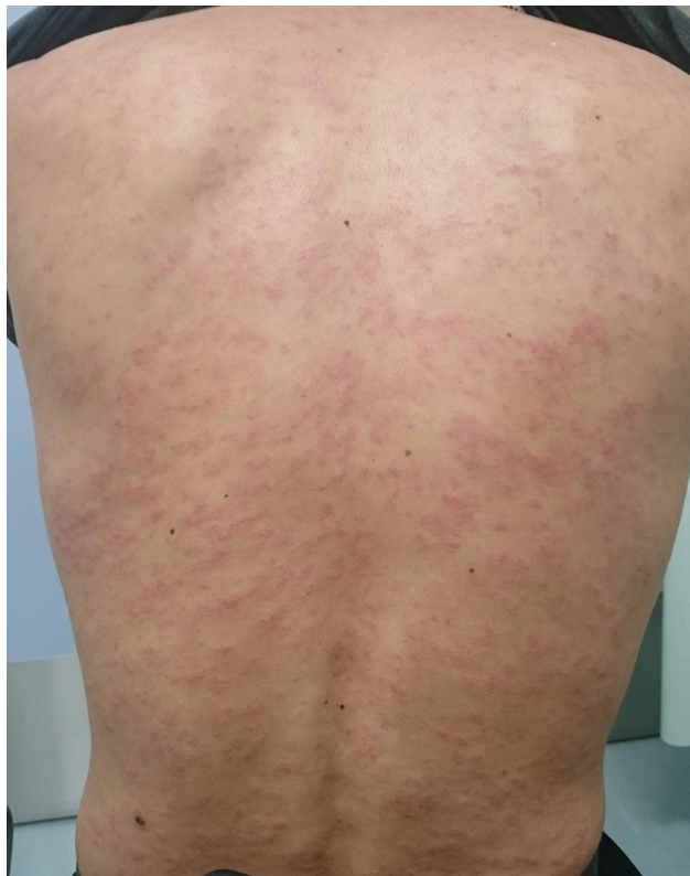
Figure 2. Rash on the back of a patient (patient 10 in Table 1) with confirmed Trichinella T9 infection associated with consumption of bear meat, Japan, December 2016. Patient had onset of macular and papular, confluent, and pruritic rash with diffuse blanching on the scalp, face, chest, abdomen, back, and upper and lower extremities. Photo taken 24 days after the patient had consumed the implicated bear meat.

*Laboratory data were obtained at initial presentation. Values are no. (%) patients except as indicated.