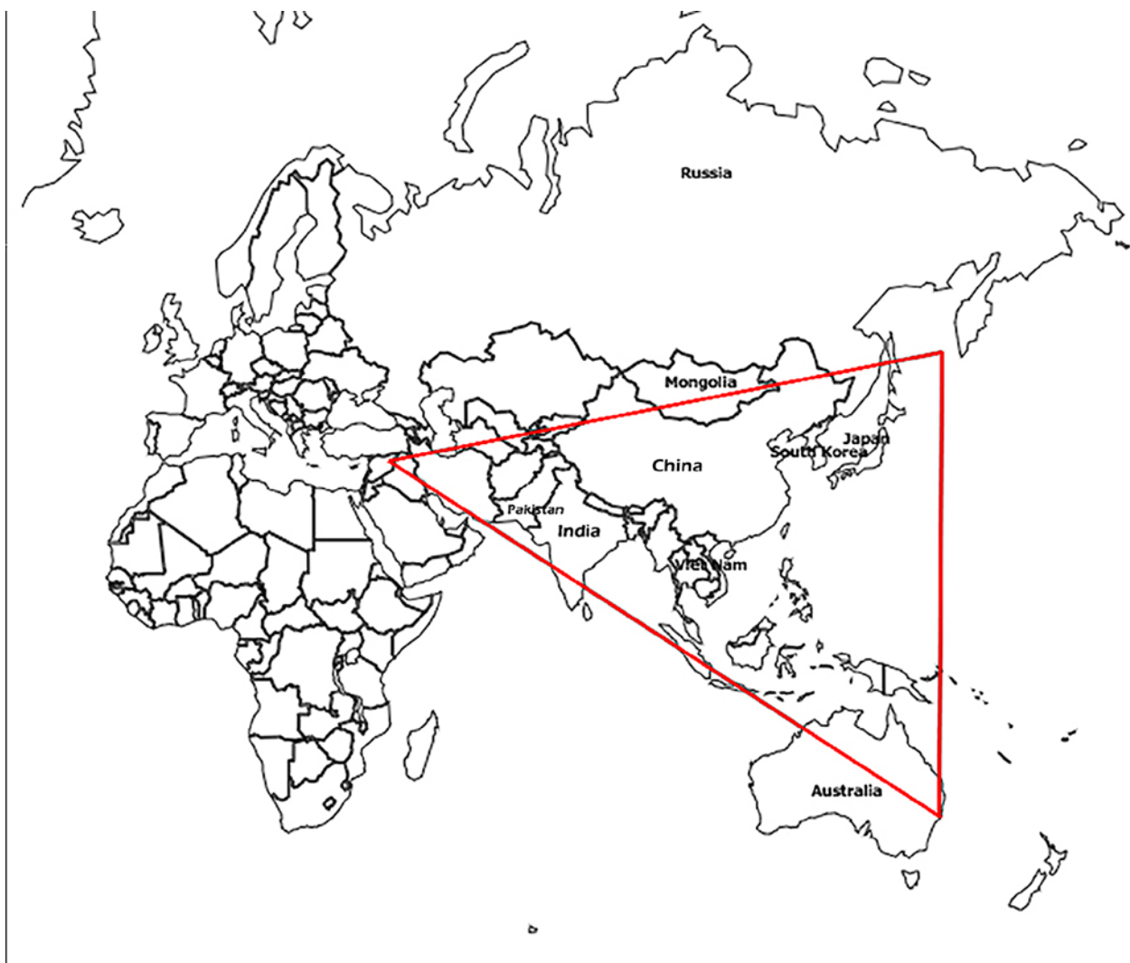
Technical Appendix Figure 1. The tsutsugamushi triangle (in red). More than 1,000,000 cases of scrub typhus, which is a mite-borne infection caused by the bacterium, Orientia tsutsugamushi , were reported in this area during 2003.