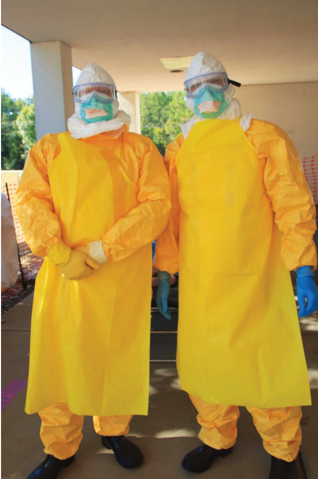
Figure 2. Example of personal protective equipment (PPE) used during the Centers for Disease Control and Prevention Ebola Safety Training Course, held at the US Federal Emergency Management Agency Center for Domestic Preparedness in Anniston, Alabama, USA, 2014–2015. From top to bottom: head covering, eye protection, N95 respirator, apron over coverall, 2 pairs of latex gloves, gum boots.

activities, trainees learned a regimented doffing process in a designated area of the mock ETU, performing the structured PPE removal sequence under direct supervision of course instructors and the observing partner.