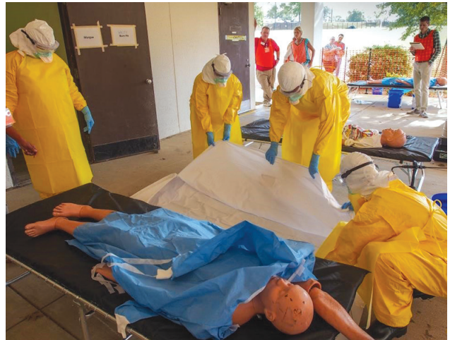
Figure 3. Constructed mock Ebola Treatment Unit used during the Centers for Disease Control and Prevention Ebola Safety Training Course, held at the US Federal Emergency Management Agency Center for Domestic Preparedness in Anniston, Alabama, USA, 2014–2015. Trainees prepare to place a simulated deceased patient into a body bag.

By March 25, 2015, 570 trainees had attended a total of 16 course sessions. Trainees came from US governmental agencies ( n = 352 , 62%); 43 nongovernmental organizations, ( n = 164 , 29%); and other organizations, including foreign governments, private healthcare organizations, and academic institutions ( n = 54 , 9%) (Table 2). Trainees traveled from 36 states and 20 countries to attend the course. To our knowledge, although most deployed to ETUs in