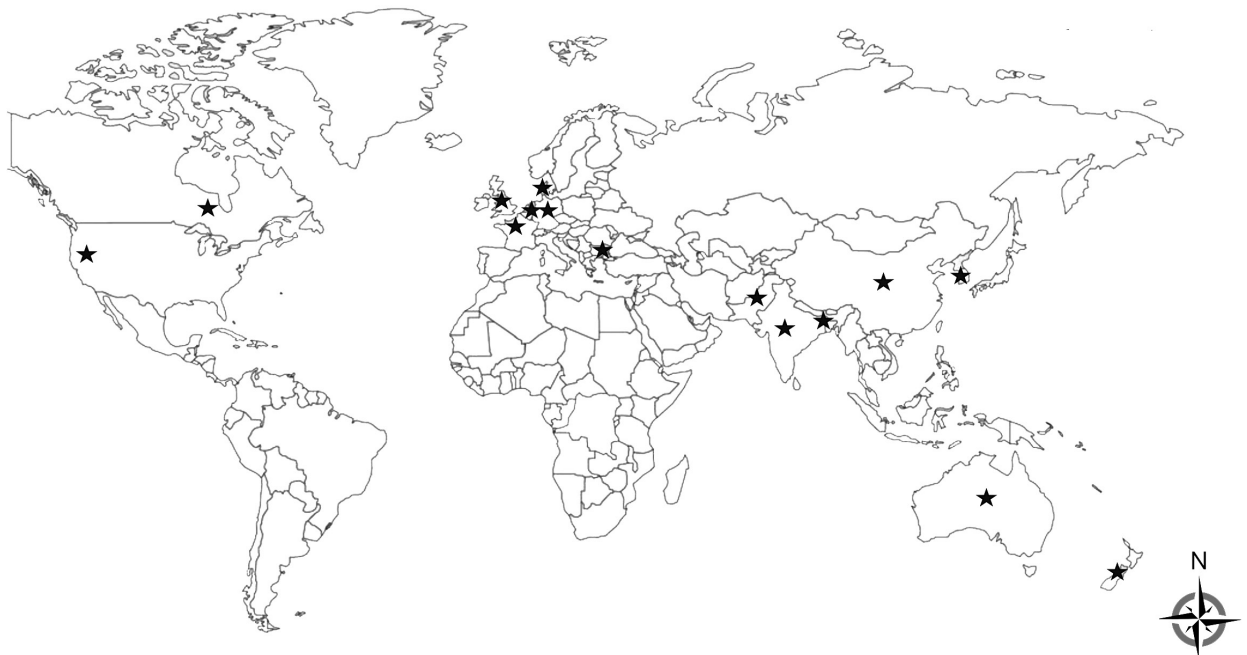
Figure 2. Sites where New-Delhi metallo- \beta -lactamase variant 1 (NDM-1)-encoding Escherichia coli sequence type (ST) 101 isolates have been detected worldwide. Stars indicate countries where NDM-encoding E. coli ST101 has been detected: Australia, Bangladesh, Belgium, Bulgaria, China, Canada, Denmark, France, Germany, India, Korea, New Zealand, Pakistan, the United Kingdom, and the United States.

Because E. coli is the leading cause of human urinary tract infections, bloodstream infections, and neonatal meningitis, the ability of NDM-1 to give this bacterium clinical resistance to carbapenems is of concern (14). E. coli is also universally carried in the human gut. Therefore, we focused on this species because it is likely to be the greatest threat to human health. E. coli encoding NDM-1 were found in 3 of the 7 sampled regions, and genotyping showed they belonged to only 3 STs: ST648, ST101, and ST405. These same 3 E. coli genotypes are