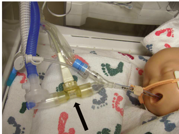
Figure 2. Draeger Evita v500 respirator. Arrow indicates Neoflow air flow sensor.

to the ventilator, reusable respiratory equipment comprised a proximal air flow sensor, expiratory flow sensor, exhalation valve, and circuit temperature probe. The sensor closest to the newborn's mouth was an air flow sensor located inside the disposable ventilation circuit (Figure 2). From 9 environmental cultures obtained from 9 air flow sensors, 1 was positive for Bacillus spp., and was later confirmed as B. cereus by the State Public Health Laboratory.