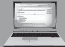
Table of contents Podcasts Ahead of Print Medscape CME Specialized topics