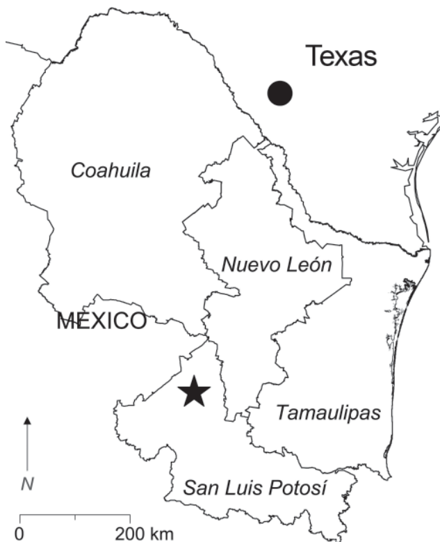
Figure 1. Southern Texas and 4 states in northeastern Mexico. The filled circle in southern Texas indicates the locality in which Catarina virus is enzootic. The star in San Luis Potosí indicates the location of the study site (23°49'5"N, 100°49'54"W). Antibody (immunoglobulin G) to Whitewater Arroyo virus previously was found in white-toothed woodrats ( Neotoma leucodon ), a Mexican woodrat ( N. mexicana ), and deer mice ( Peromyscus spp.) captured in Nuevo León; white-throated woodrats ( N. albigula ) and white-toothed woodrats captured in San Luis Potosí; and deer mice ( Peromyscus spp.) and a southern plains woodrat ( N. micropus ) captured in Tamaulipas (M.L. Milazzo, unpub. data).

was isolated from none of the 12 animals included in the virus assays.