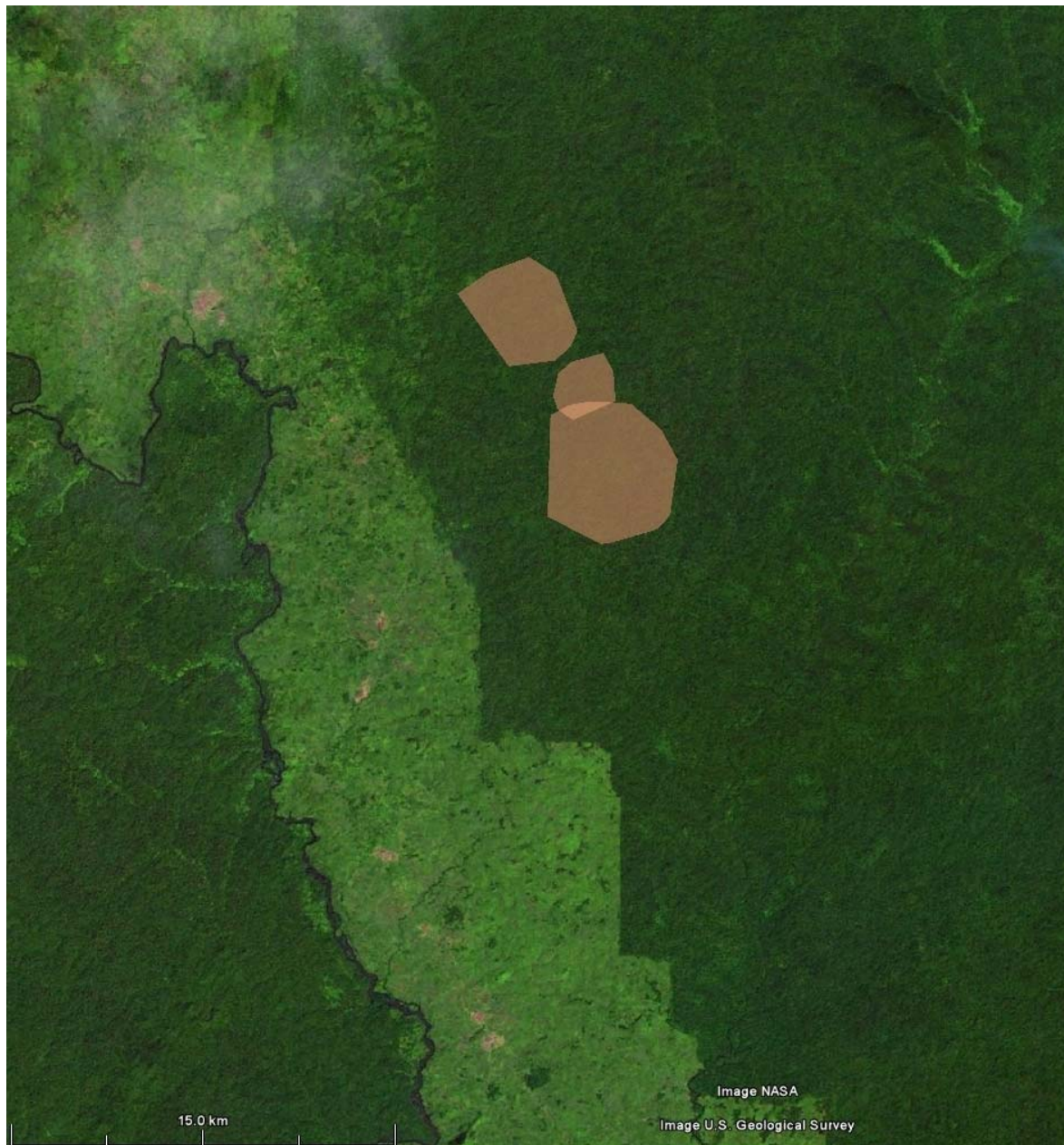
Technical Appendix Figure. Satellite image of habitat of wild chimpanzees investigated in Tai National Park, Côte d'Ivoire. The shaded areas show the maximum extension of the territories of the communities studied. Pristine forest is dark green.