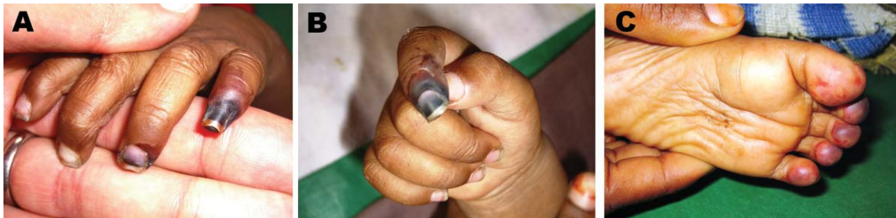
Figure 1. Digital gangrene in an 8-month-old girl during week 3 of hospitalization. She was admitted to the hospital with fever, multiple seizures, and a widespread rash; chikungunya virus was detected in her plasma. A) Little finger of the left hand; B) index finger of the right hand; and C) 4 toes on the right foot.

In our study, we chose to rely on PCR detection of the virus to diagnose CHIKV infection rather than testing for IgM antibodies, which may persist for several months after infection and could reflect coincidental infection (19) rather than an acute infection. In summary, during CHIKV outbreaks, clinicians should be aware that CHIKV may be a cause of CNS infections among children.