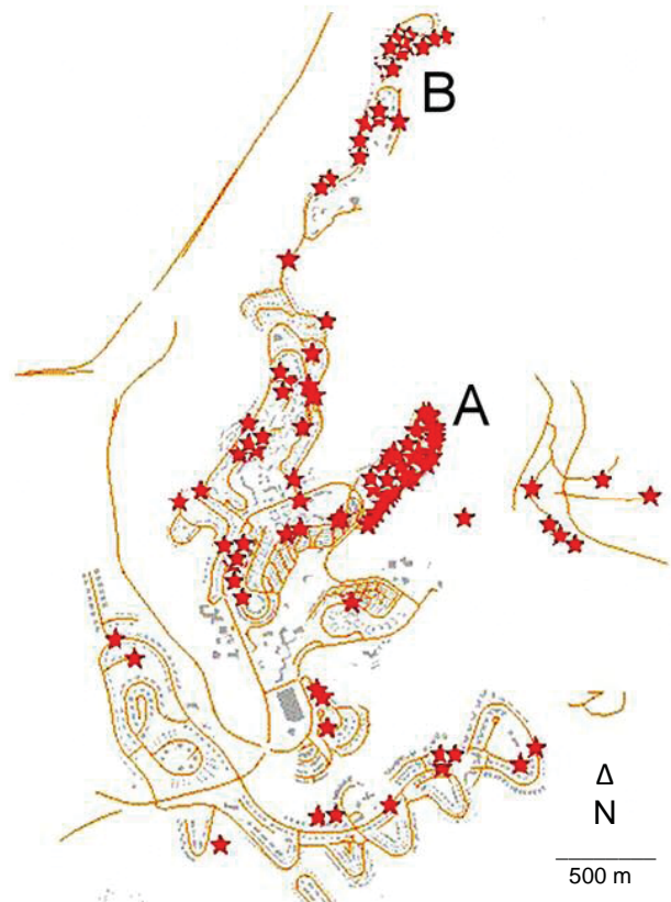
Figure 2. Geographic distribution of cutaneous leishmaniasis cases in Ma'ale Adumim, Israel, 2004–2005. Each star represents 1 case. In dense areas, some marks may be missing because of technical limitations. Wilderness ravines (white areas) reach within meters of houses at the periphery of the neighborhood in all directions. A and B indicate neighborhoods with the highest incidence rates.

In 2006, Chaves and Pascual reported that climate was a valuable covariate in predicting incidence of CL (12). A 1996 computerized model examined the effect of warming of 1°C, 3°C, and 5°C on the likelihood of CL transmission at 115 southwest Asian sites. Sandflies are not known to reproduce in Jerusalem, but Cross and Hyams suggest that Jerusalem could support endemic transmission if the average temperature increased by 1°C (13). Since that model was proposed, the average temperature in Jerusalem has increased by ≈1°C (14). The spate of recent outbreaks sug-