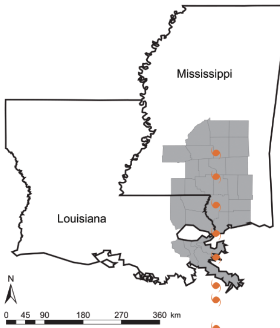
Figure 1. Hurricane Katrina track and hurricane-affected Louisiana parishes and Mississippi counties. Affected parishes and counties (gray) were defined as those in which >50% of the total area was ≤50 miles of the hurricane track coordinates.

A similar pattern was observed in Mississippi. In the 3 weeks after landfall, the affected region showed an increase from 0 to 10 WNND cases; the unaffected region of Mis-