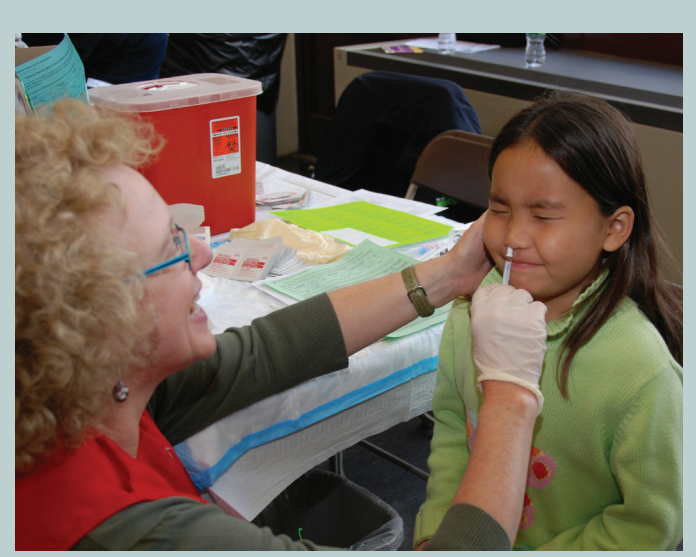
Supplemental funding was used to provide additional resources for mass vaccination planning and implementation, and to support the 2009 H1N1 vaccination campaign. Pictured is an H1N1 vaccination clinic in Cambridge, Massachusetts.