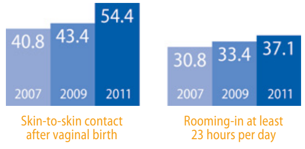
Figure 1: Percent of hospitals and birth centers where most infants experience skin-to-skin contact and rooming-in — mPINC 2007, 2009, and 2011

immediate and continued contact between mother and baby during the hospital stay: skin-to-skin contact within one hour after birth and rooming-in together throughout the stay. While both skin-to-skin contact and rooming-in improve breastfeeding rates by helping mothers establish