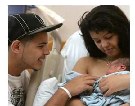
noto: Rochester General Hospital, Rochester, NY

NOTE: Percents in bold are those that have met the Healthy People 2010 goal.