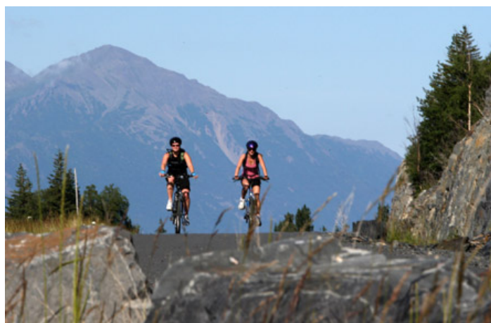
Figure 1. Ride for Life Alaska fundraiser bicycle participants, 2007

ride turned into a cancer fundraiser. Holman, having just experienced the personal effects of CRC, felt passionately about raising funds for cancer prevention and education. A core group of volunteers joined efforts to move the project forward. Event coordination included gathering all necessary permits and insurance, advertising with bicycle clubs and outdoor groups, and setting up camping space, food, rest stops, support stations, and transportation for participants back to Anchorage after the ride. The first night of the ride also includes a "Celebration of Life" dinner, which features speakers and riders sharing their cancer experiences and honoring those who have died of cancer.